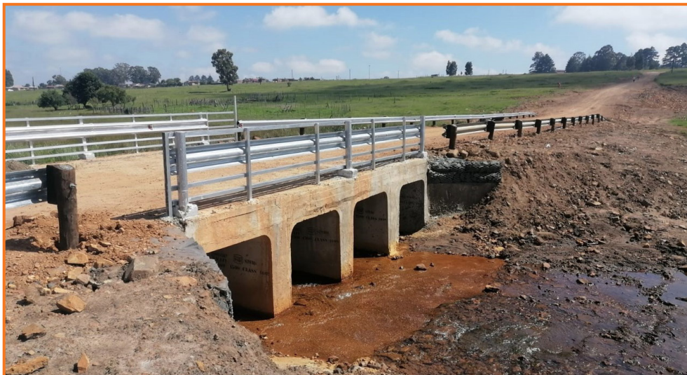
The completed bridge between Sobhuza Primary School and Carolina.