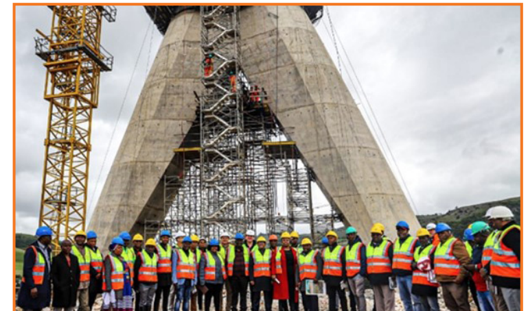
Msikaba bridge construction site.