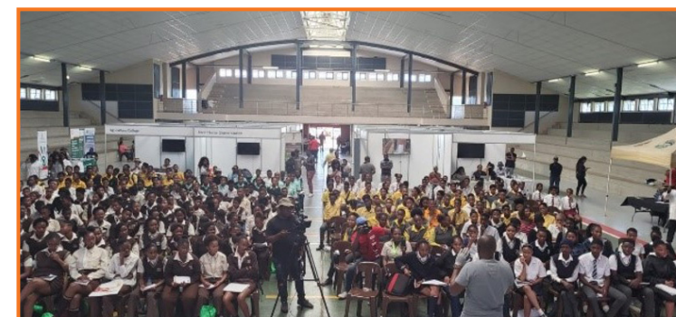
Learners who attended the event.