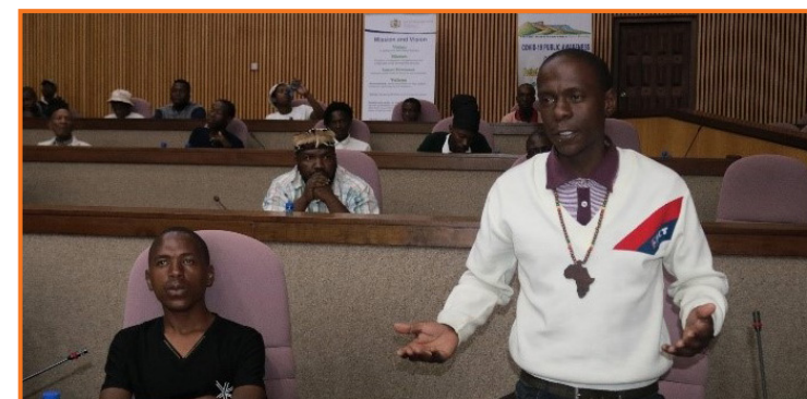
Men engaging each other during the discussions.