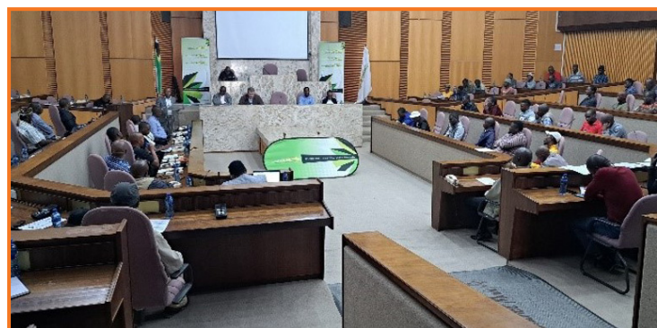
Men who attended the Thabo Mofutsanyana District Men's Parliament.

This forums would allow men to engage and advice each other on responsibilities that comes with being a role model and father figure in the society.