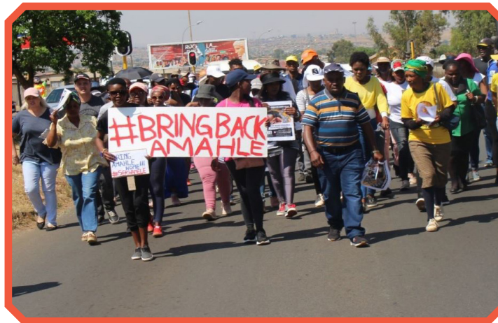
Community members marching against GBV.

Stakeholders that organized the march include the One Strong Voice Foundation, Refiloe and Thuto Foundation, Thabang Xaba Foundation, Resurrect Foundation, Springs PCO and the Hlase Mpho Foundation.