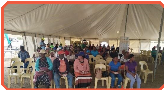
Community members attending the event.

Gladstone is located far from cities, hence government saw a need to visit the community for engagement and to provide services. Each departments explained the type of services they offer while others assisted people on the spot. Community members also received information materials on government programmes.