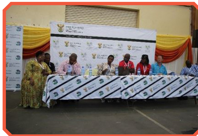
Stakeholders addressing community members.

Community members expressed gratitude for the information. Government information material on water-saving tips, GBV, and Vuk'uzenzele and InSession newspapers were distributed to the community members.