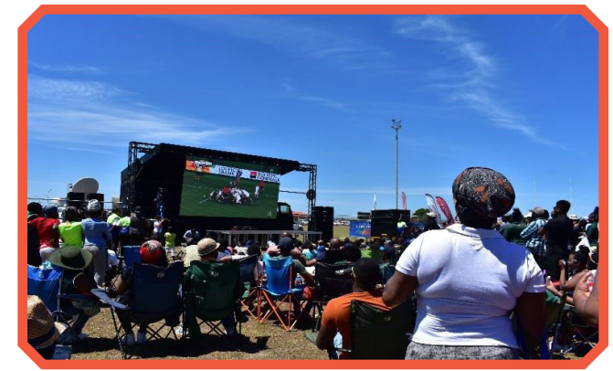
Fans watching the World Rugby Cup Final at Zwide Stadium.