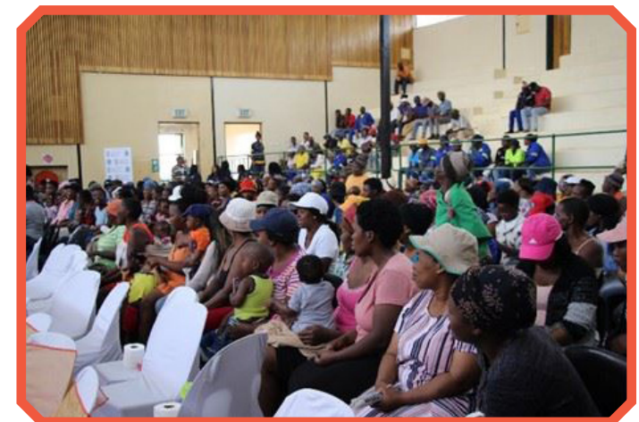
Community members attending the session.