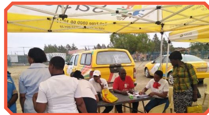
Government officials assisting community members.