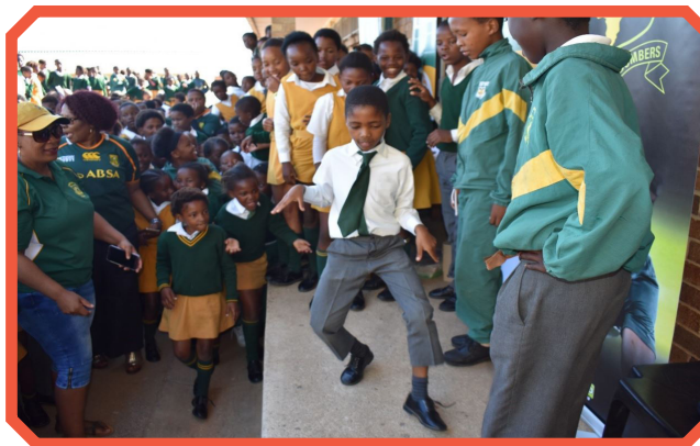
Emsengeni Primary School learners celebrating the Springboks' victory.