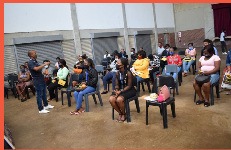
The eThekweni Municipality Academy Unit engaging with the youth on available employment opportunities.