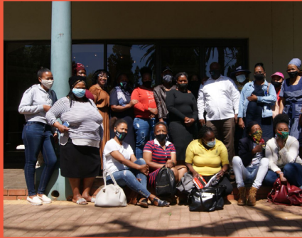
Community based planners recruits posing with government leaders.