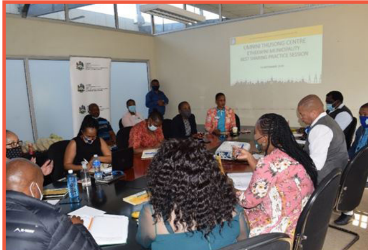
The leaders of eThekweni Municipality engaging with delegates.