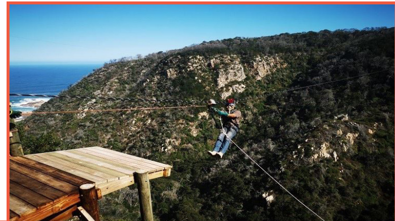
Members of the public during an adventure at the Knysna ziplines.

SANParks has launched another thrill-seeking product to boost tourism in the Garden Route. The Knysna Ziplines offer breath-taking views of the sea and forest at 250 metres above the Kranshoek gorge between Knysna and Plettenberg Bay. The Garden Route's longest and highest zipline is ready for those scouting for an exhilarating expedition.