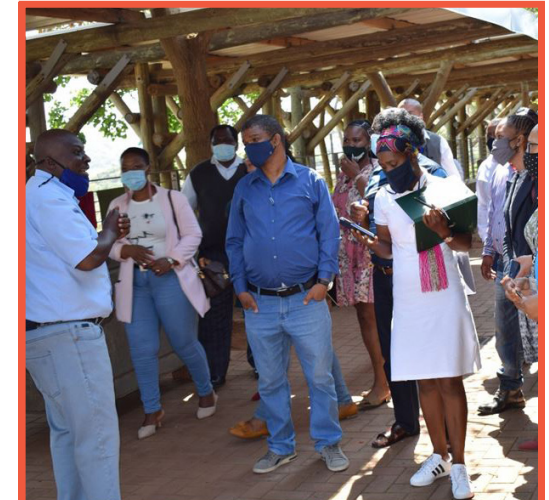
An official from eThekweni Business Support Unit engaging with various stakeholders.

To commemorate Public Service Month and Annual Thusong Service Centre Week, Mnini Thusong Service Centre in eThekweni Municipality invited centre managers from all over KwaZulu-Natal to be part of a benchmarking exercise and share best practices, focusing on how to coordinate, organise and run Annual Thusong Service Centre Week activities.