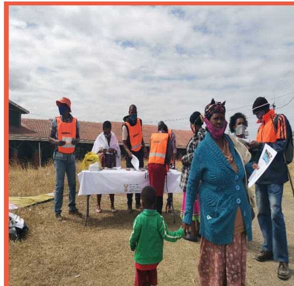
The distribution of flyers at Tombo Thusong Service Centre.