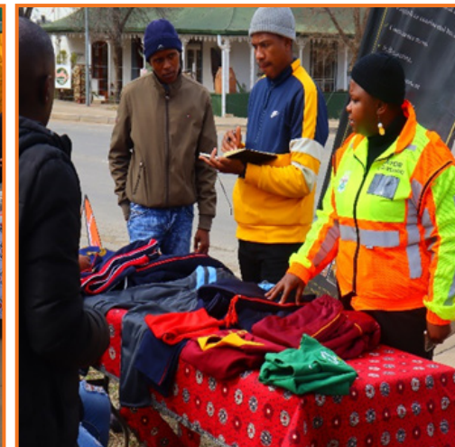
Community members visiting an exhibition stall at the event.