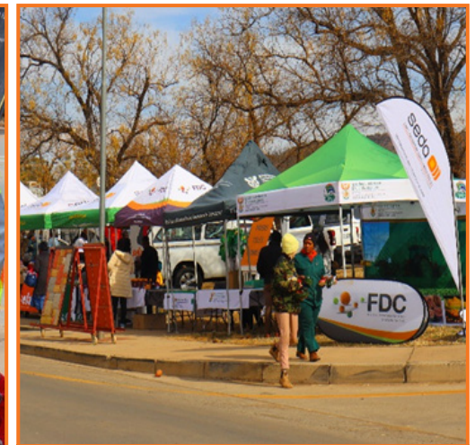
Some of the stakeholders who exhibited their products and services at the event.