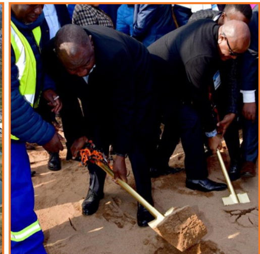
President Ramaphosa and other dignitaries at the event.