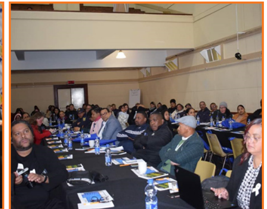
Various stakeholders at the event.