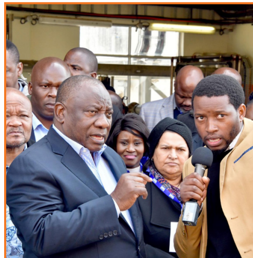
President Ramaphosa receiving a briefing about the work done at Danville water treatment plant.

Issues that came into the spotlight during the Imbizo include youth unemployment, drug abuse, and water and electricity shortages. The President added that government was working tirelessly to create job opportunities for the people of South Africa.