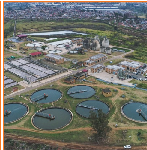
Danville water treatment plant.