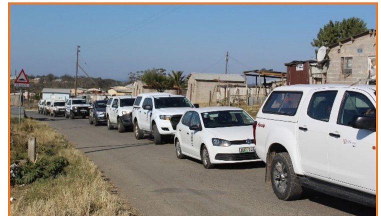
The loud-hailing motorcade during the activation in Nompumelelo and Ducats townships.