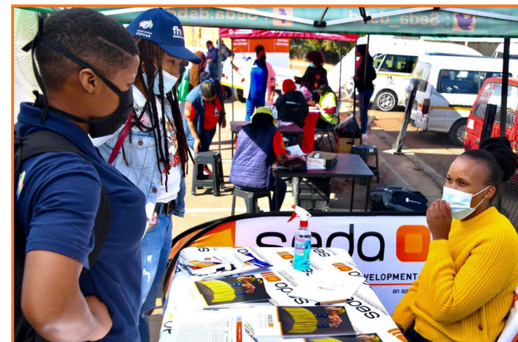
Stakeholders sharing information material with community members.