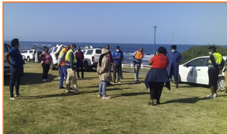
The various stakeholders during a starting session for the loud-hailing programme.

These activations in the Buffalo City Metro are to continue throughout the month of July in the different regions, reminding people of the non-pharmaceutical protocols to follow to ensure that they curb any further spread of the virus and to ensure the metro's active cases do not increase further.