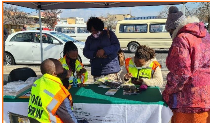
A government official registering people for vaccination in Lejweleputswa.

People who are 35 years and above are now eligible to register for the vaccine. It is also important to note that those who tested positive to COVID-19 need to wait 30 days after contracting COVID-19 before being vaccinated.