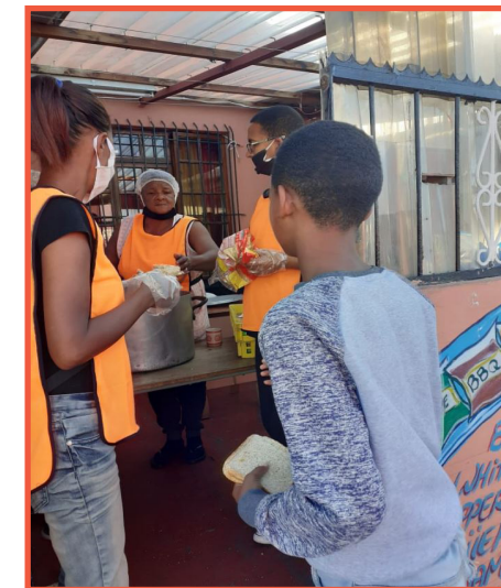
Community members receiving food from Kuilsriver Cape Town Together Community Action Network volunteers.