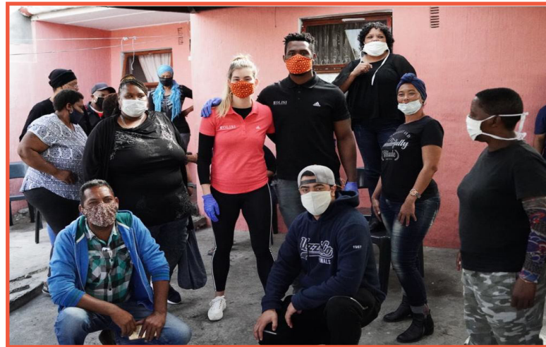
Volunteers of Cape Town Together Community Action Network ready to serve the communities.

Leaflets on COVID-19 preventative measures together with soap donated by the City of Cape Town Disaster Management and bread from a local supermarket were distributed among community members.