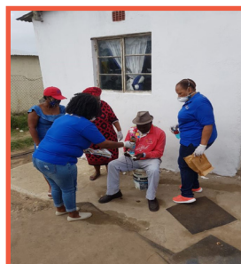
Community members receiving sanitisers and gloves.

Government has called for continued cooperation among communities, strengthened collaboration between government and various sectors in an effort to contain the spread of COVID-19.