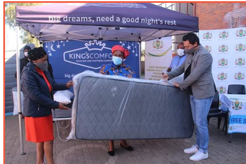
King's Comfort officials handing over one of the 60 beds to the Free State Provincial Government.

Children at the centre will have their own beds instead of sharing, thus ensuring social distancing, which in turn will prevent the spread of COVID-19. The donation by King's Comfort serves a proof that private and public sector relationships are essential for community development.