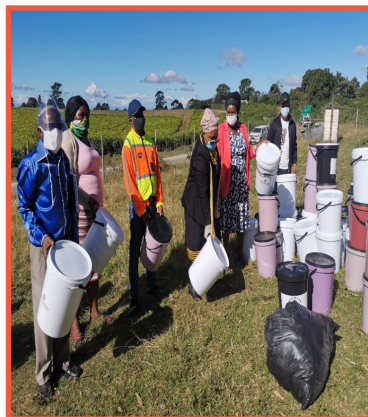
OR Tambo District Municipality officials during the handover of equipments to the community.