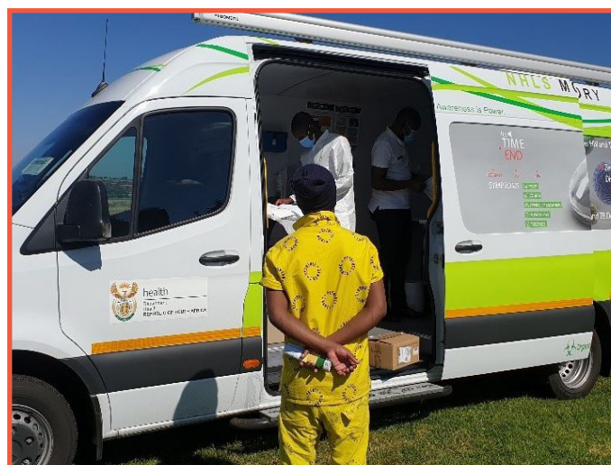
An inmate waiting to be tested for COVID-19 at the Bethal Correctional Centre.

The inmates welcomed government's initiative to have all community members tested including those in correctional centres. In total, 1 120 offenders were screened and tested in Bethal Correctional Centre. To date, more than 486 619 screenings have been conducted in Mpumalanga.