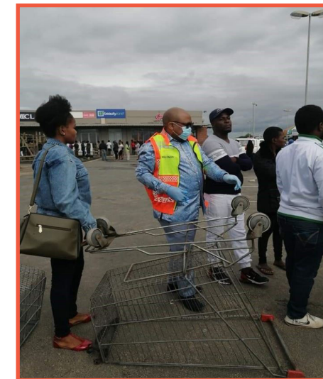
Mayor Mduduzi Mhlongo encouraging the practice of social distancing at eSikhaleni Mall.