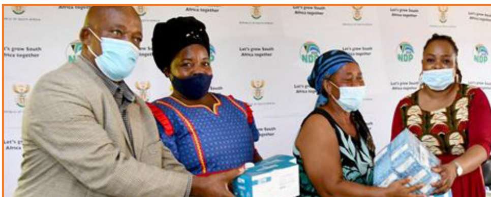
The handing over of sanitary packs, sanitisers, masks, and other basic necessities.

The programme ended at Maruleng community radio station where community members were engaged in discussing government programmes and interventions on GBVF.