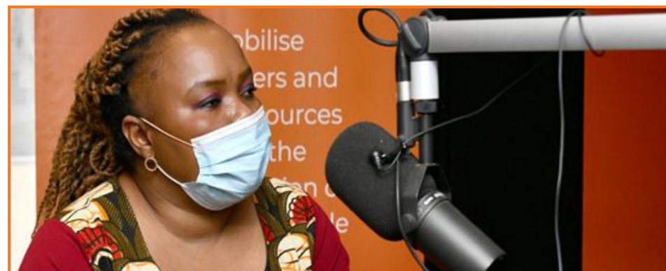
Deputy Minister Thembu Siweya talking about government programmes at Maruleng community radio station.