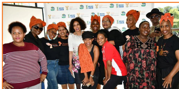
Some of the women in the tourism industry at the event.

The Minister assured the family that her department would collaborate with local authorities and the Department of Sport, Arts and Culture to ensure that the memory of Mutwa is preserved.