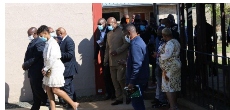
Minister Nathi Mthethwa and the delegation doing a walkabout at the Winnie Madikizela Mandela Museum.

Minister Mthethwa said this year celebrations are happening in a differently environment due to the COVID-19 pandemic whereby we have to be cautious of our behaviour in order to stay safe and protect lives.