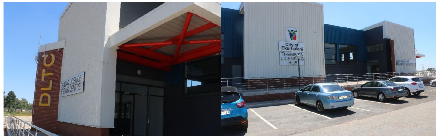
Thembisa Licensing Hub that has just been launched.

Services offered at the hub include renewal of motor vehicle licenses, registrations of motor vehicles, deregistration of vehicles, notices of change of ownership, change of personal details, application of business registration numbers and application of traffic register certificates.