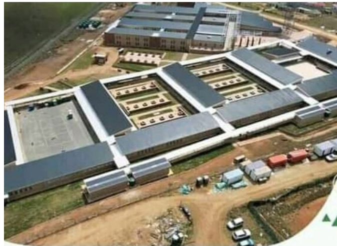
The aerial view of Pholela Special School.