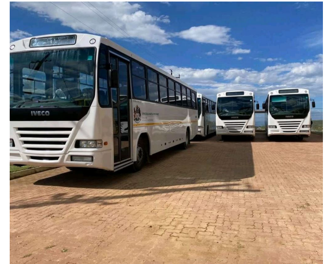
High-tech buses were also handed over to Pholela Special School.