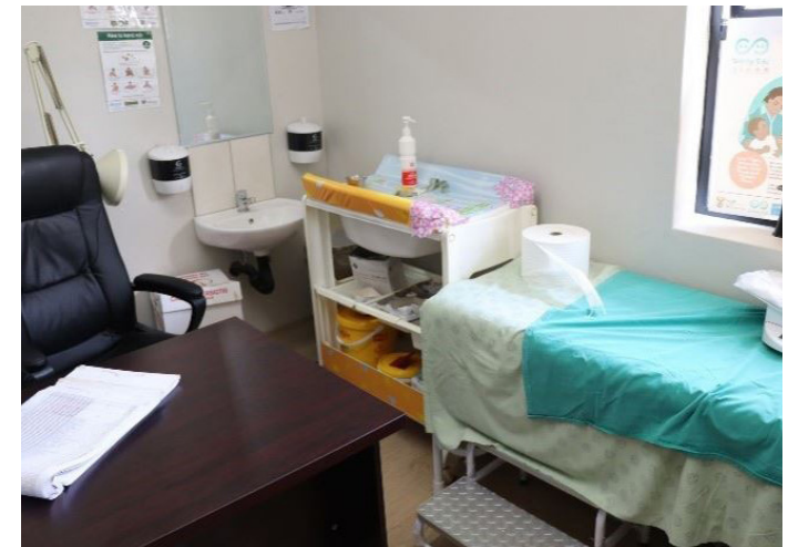
One of the consultation rooms at the new Glory Hill Clinic.

This improved establishment comes at a very crucial time as COVID-19 numbers increase and community members need an accessible healthcare facility where they can be tested. The handover of such a facility at this critical time, is indeed appreciated and will be very beneficial also in the fight against COVID-19 pandemic.