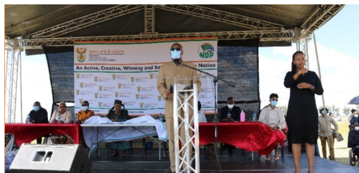
Minister Nathi Mthethwa address the audience during the launch of Freedom Month.

The Minister of Sport, Arts and Culture, Nathi Mthethwa, officially launched Freedom Month at Veerkerdevlei, Free State on 7 April 2021. This year's Freedom Month is celebrated under the theme: "The Year of Charlotte Maxeke: the Meaning of Freedom under COVID-19".