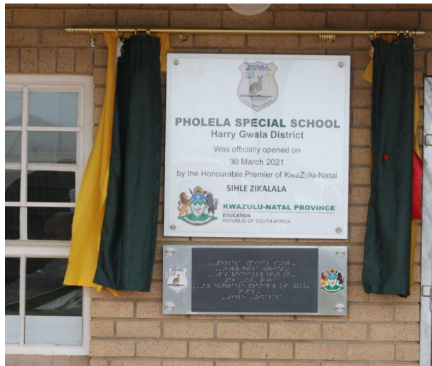
Pholela Special School which was officially opened.

The school currently has an enrolment of 350 and caters for children with intellectual, physical and sensory disabilities.