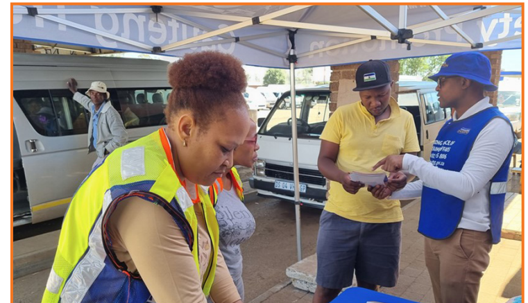
Government officials engaging the community in raising awareness about road safety at Meyerton Taxi Rank.