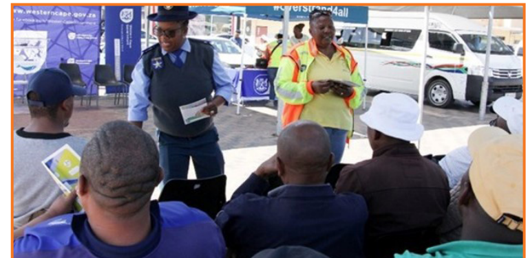
Traffic officers speaking to taxi association members about transport and road safety.