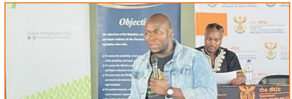
A representative from the MEGA presenting on their services and funding offers.