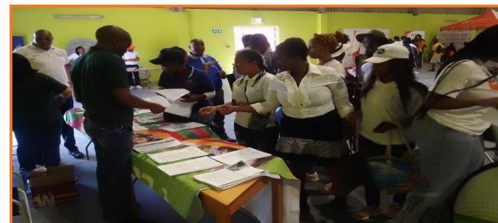
The Department of Employment and Labour sharing information about government opportunities.