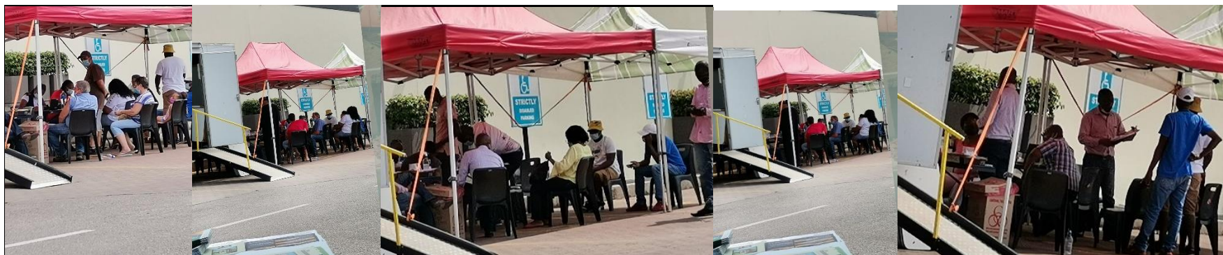
Tshwane Health officials administering COVID19 vaccination to the community members.