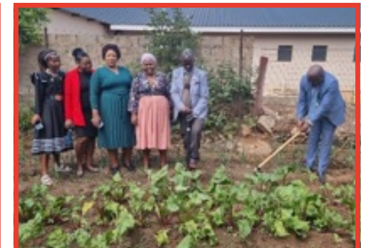
Members of the EPWP during the harvest. The Mayor and members of the Exco visited the garden.