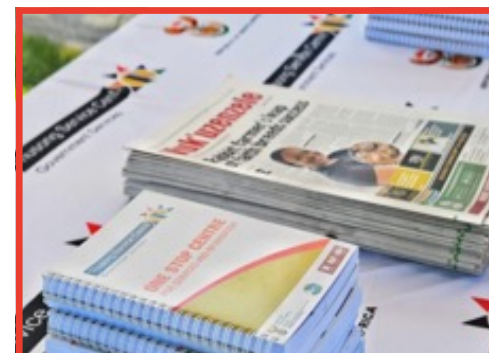
The opening event was integrated into an outreach where various government departments, entities and the private sector provided services and information.