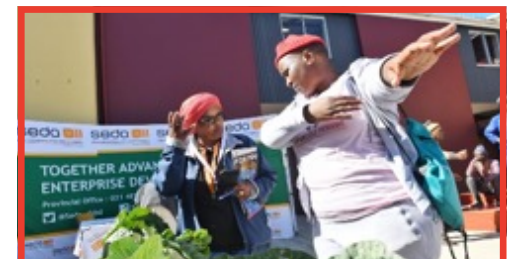
The backyard gardening at Unobuntu Thusong Centre. The Small Enterprise Development Agency (SEDA) was part of the exhibitors and the soup kitchen which is linked to the food gardening.