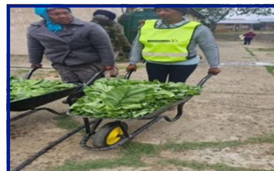
Thusong stakeholders harvesting vegetables and later donated them to nearby schools.