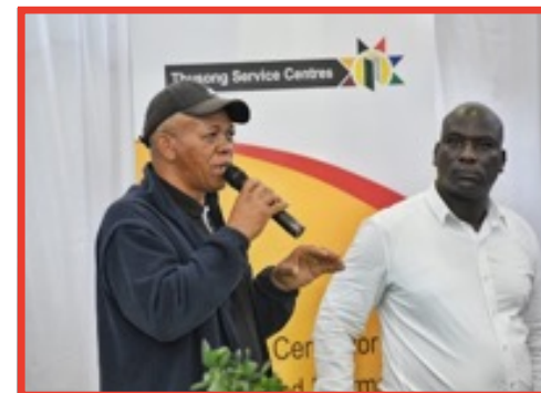
Delegates from different organisations raising various issues in relation to food security while officials from entities sharing information in relation to the sustainability of food gardening.