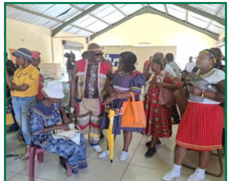
The Executive Mayor and delegates doing a walkabout at the centre. Members of the community who came to access services.