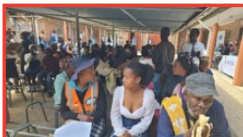
Community members who attended the session.