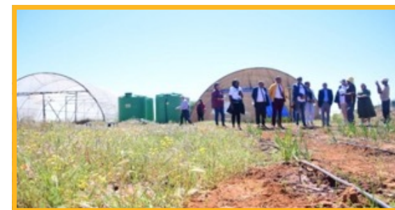
The food gardening at Loeriesfontein. Government leaders visited the garden.