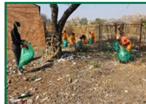
Moletsi Thusong Centre food gardening, the centre managers and Thusong stakeholder during the cleaning campaign.