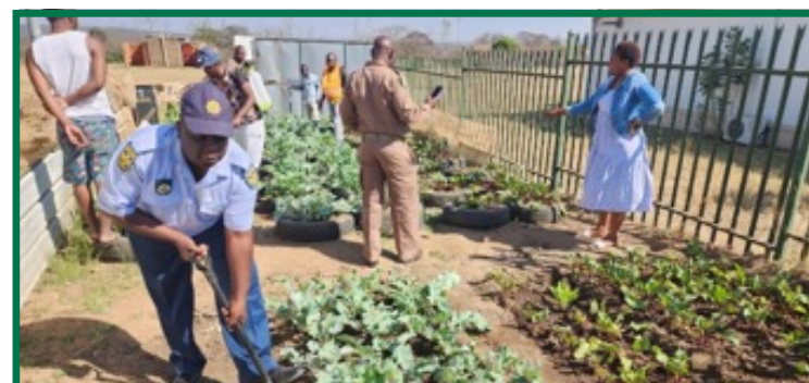
Stakeholders at the centre during irrigation and harvesting.