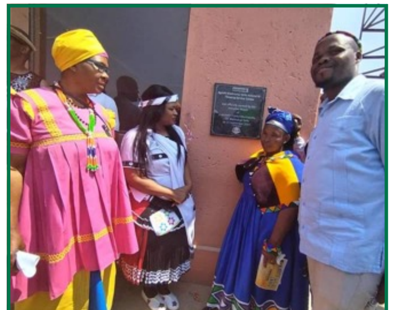
The Executive Mayor and Moshate unveiling the plug of the new Thusong Service Centre.