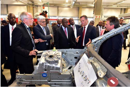
Mercedes-Benz Board Management Representatives briefing the President on the production processes of the plant.