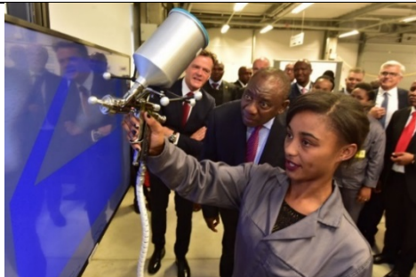
Students simulating the paint job to the President during his walk-about to the plant.