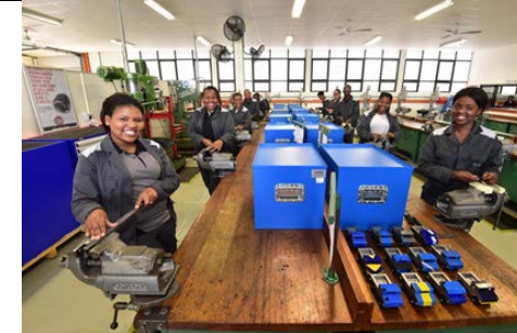
Students at the Mercedes-Benz East London plant learning academy showing off their equipment.