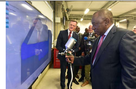
President Ramaphosa trying out a paint simulation at the Mercedes-Benz East London plant.