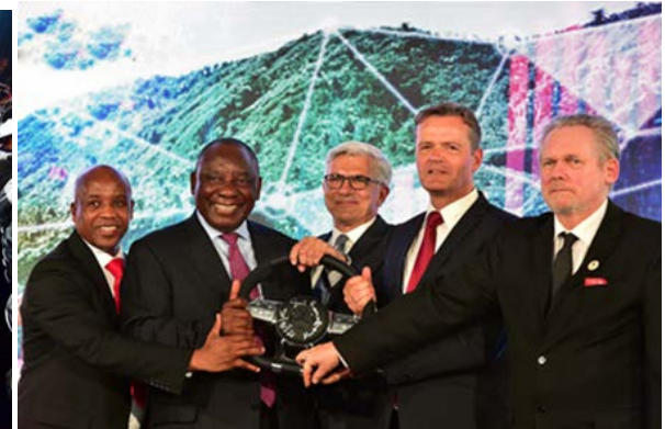
The President delivering the key note address and welcoming the announcement of the expansion of the Mercedes Benz East London plant.