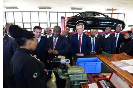
President Ramaphosa engaging the management at Mercedes-Benz East London plant.