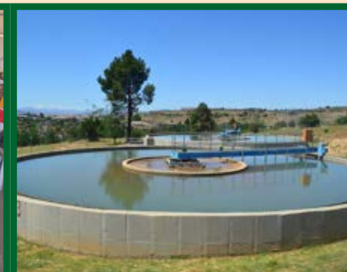
Ficksburg water plantation.

Water and Sanitation Minister Nomvula Mokonyane visited Meqheleng, Ficksburg on 4 December 2015 as part of the national Imbizo Focus Week to engage with the community about water shortages. During her visit, the Minister also launched a water plantation site where the Ficksburg community will recycle water. Minister Mokonyane visited residents of Zone 8 in Meqheleng, whom government has provided with flushing toilets and running water in their yards. The main event of the day took place at a packed Meqheleng Stadium. Community members provided the Minister with suggestions that could help end water problems in the area.