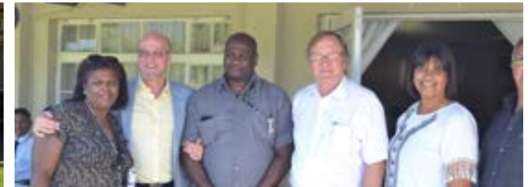
Minister Hanekom and other dignitaries at the event.

Tourism Minister Derek Hanekom told graduates that training in hospitality can change the lives of young people forever. Minister Hanekom was speaking at the graduation ceremony of students who qualified in wine service at Breede Valley in the Western Cape on 8 December 2015. The National Department of Tourism (NDT) provided training for 200 learners.