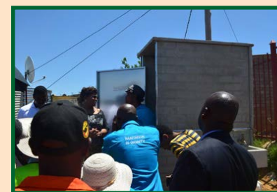
Minister Mokonyane with recipients of water-saving gadgets.

“We request government to provide us with water-storage tanks to use for our car wash business.”