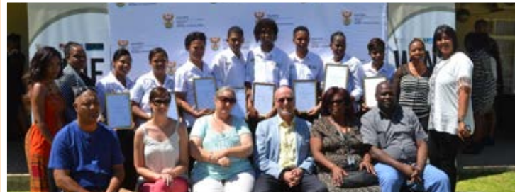
Minister Hanekom with some of the graduates, ward councillors and representatives from the private sector.