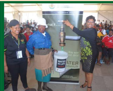
The Minister engaging with community members.