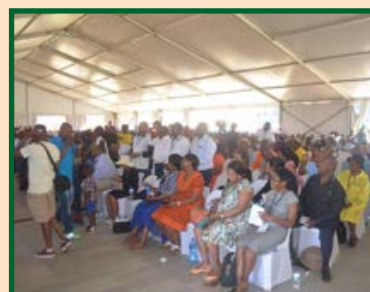
Community members at the event.

“I am happy that we are now receiving ground water after so many years of struggle in Naledi. We would like to thank government for this move.”