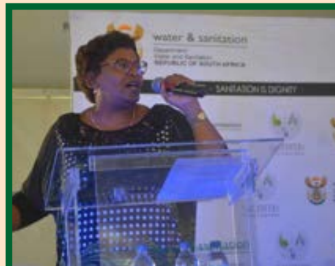
Minister Mokonyane addressing Meqheleng community members.