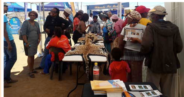
Participants accessing services and information from various stalls.

The Northern Cape Provincial Government took services and information to the people of Colesberg. The province conducted the Government Exhibition Day in Toto Mayaba on 18 November 2015. Government entities, non-governmental organisations and agencies participated in integrated one-stop information and service offering. This was done to serve communities that do not have access to government information and services.