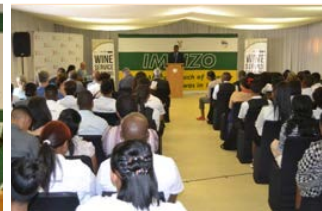
Attendees at the event.