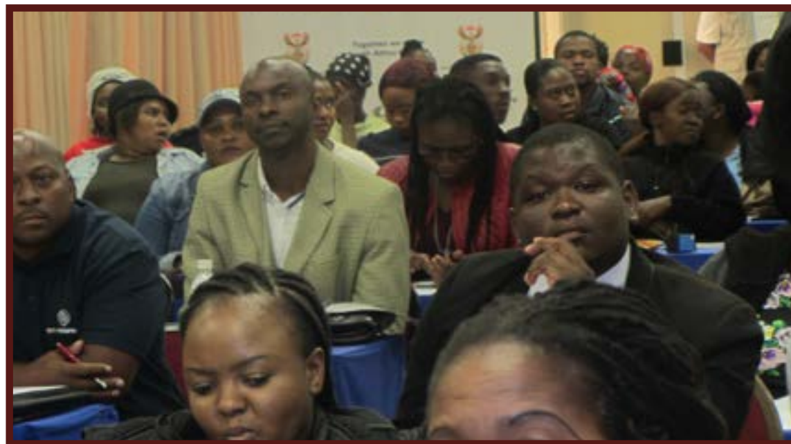
Some of the participants listening to presentations about the impact of climate change on their lives during the Climate Change Awareness Seminar.

Disaster preparedness is important in the case of severe weather events and South Africa is likely to suffer from such weather conditions, which can be a direct threat to the lives and properties of citizens. This includes, among others, hazards associated with heavy rain and flooding, lightning, drought and water scarcity, high temperatures, thunderstorms, hail, fires, severe cold and environmental degradation. In an effort to build a weather-smart nation that can take care of its environment, the South African Weather Service, in collaboration with community development structures of the City of Tshwane conducted the Climate Change Awareness Seminar held at Arcadia Hotel on 22 April 2016. The seminar was aimed at educating the public and empowering community members with the ability to respond proactively to severe weather events.