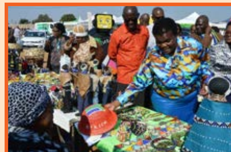
Minister Muthambi engaging with different exhibitors during the Imbizo.