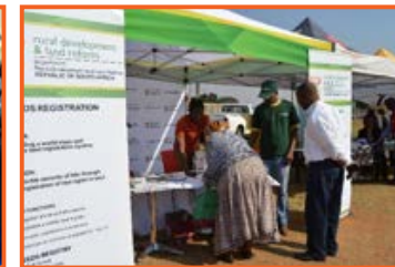
Exhibitions by government departments at their respective stalls.