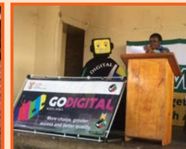
Minister Muthambi addressing community members.

The Ministry of Communications held an Imbizo at the Kwaggafontein Community Hall on 3 June 2016 as part of the lead-up programme to the Presidential Siyahloa monitoring visit, which took place on 10 June 2016. The Department of Communications and the Government Communication and Information System partnered in hosting this event, working in close collaboration with the Nkangala District Municipality and Thembisile Hani Local Municipality, particularly the communication units.