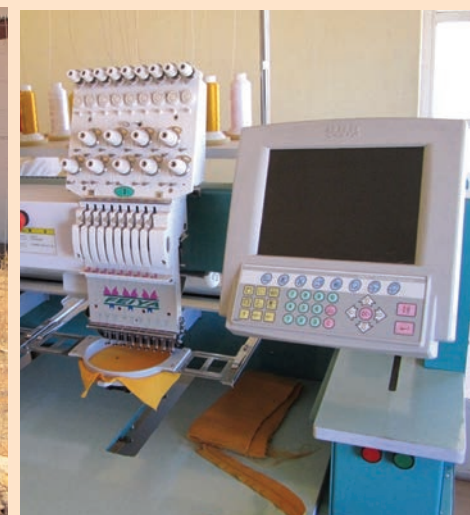
Tshwaraganang sewing machines.

The Tshwaraganang Barolong Project is a women's project that was established by a group of women in Motsitlane village in the Ratlou municipality. Their main objective was to reduce unemployment that was escalating in the village.