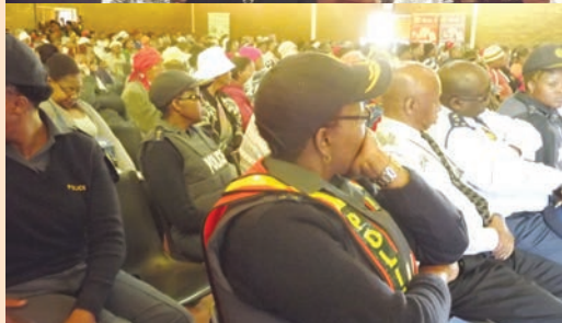
The SAPS Free State Provincial Commissioner Mr Khehla Sithole, Free State MEC for Police, Roads and Transport, Mr Butana Khompela and the Deputy Minister of Police, Ms Makhotso Sotyu during the Imbizo in Makelekettle in Winburg.