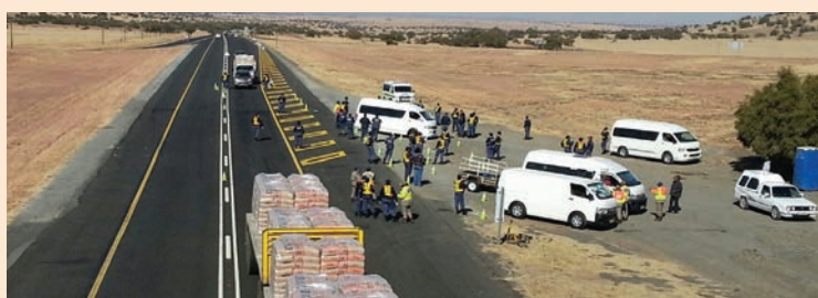
Female Police and Traffic officials conduct roadblock at the N1 road between Winburg and Bloemfontein during the Woman's Network Campaign.

As a follow-up to the recently launched Free State Crime Prevention Strategy where, as part of the strategy the youth will be expected to play a vital role in the fight against crime, the Deputy Minister of Police, Ms Makhotso Maggie Sotyu, visited Makelekettle, Winburg to address the youth on issues relating to gangsterism and substance abuse on 5 August 2013.