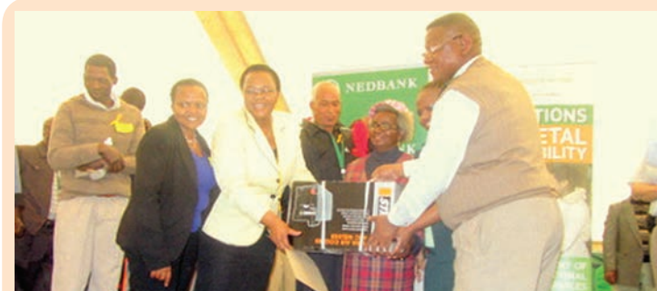
Regional Commissioner handing over starter kit (welding machine) to ex-offender.