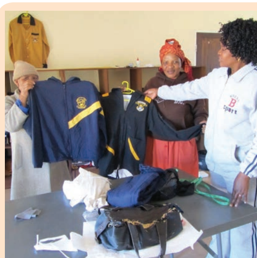
Tshwaraganang Barolong women display the school uniform they designed for the primary school in Motsitlane.