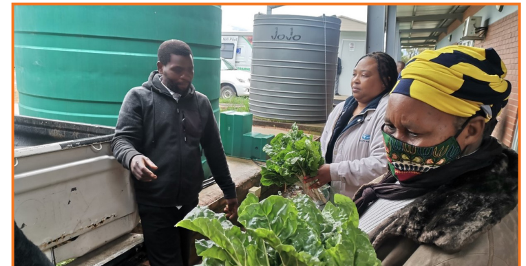
Local farmers selling their fresh produce at the centre.