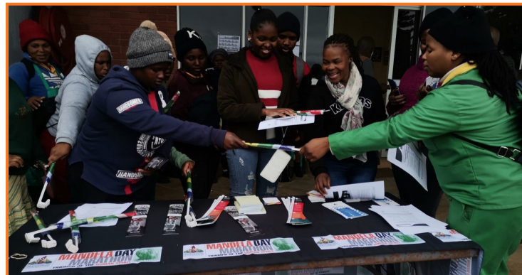
Community members accessing information products from the GCIS.

The information-sharing session also provided a platform for local emerging farmers to market and sell their produce.