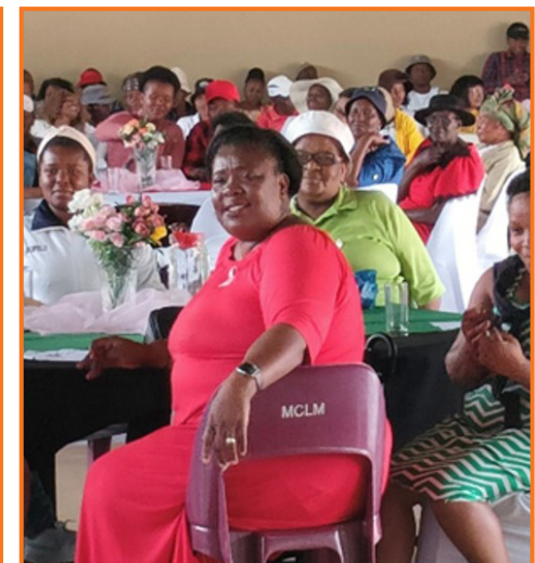
Participants from in and around Kagiso who attended the session.