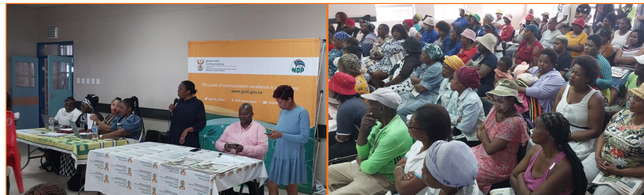
Speakers from different government departments, stakeholders and community members at the event.

The GCIS in Buffalo City Metro Municipality encouraged communities on food security, to get involved in clean-up campaigns and start community gardens to alleviate food insecurity. Communities also had access to information and government services in line with the Batho Pele principles, as part of government’s commitment of taking services to the people.