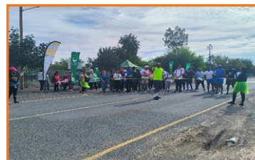
Stakeholders and participants during the walk.

Participants were also gifted trees by the Karoo National Park and the Department of Forestry, Fisheries and the Environment to plant at their homes, thus creating clean and green environments.