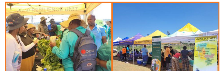
Members of Lebasadi and Nexis Fresh Projects selling their food products while the CoJ Food Resilience Unit distributed seeds.