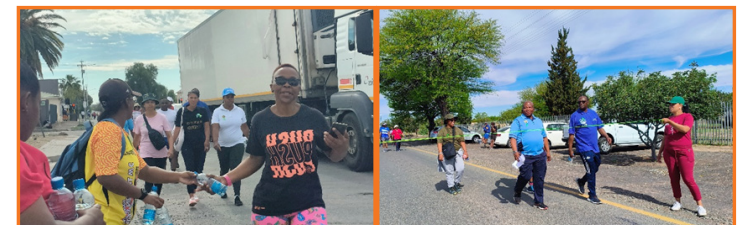
Some of the participants during the Mental Health Awareness Walk outside of the Beaufort West District Hospital.