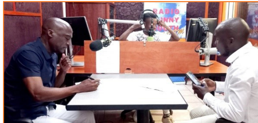
Deputy Mayor Chiya being interviewed at the Radio Sunny South Studios in Port Shepstone.

"October is Transport Month and during this month, the Department of Transport and its entities highlight transport infrastructure services in aviation; maritime; public transport and roads. This month will also be used to further advance the country's road safety initiatives, while also creating awareness of the economic benefits of the sector. Since we are approaching the Festive Season we encourage all the drivers and pedestrians in the Ugu District to adhere to road safety tips and regulations in order to avoid fatalities."