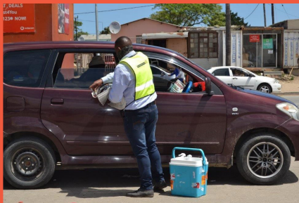
A Garden Route District health practitioner distributing COVID-19 information leaflets.