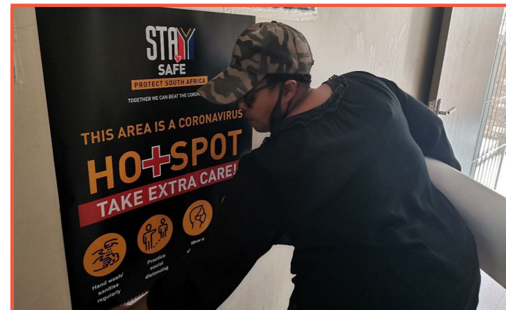
Yolisa Ramokolo from the Makana Local Municipality mounting a poster at the East Cape Midlands TVET College.