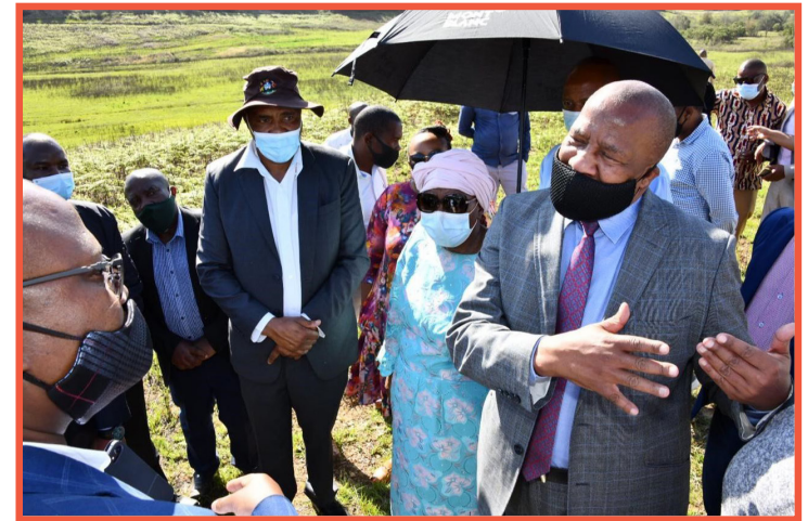
Minister Jackson Mthembu and Minister Nkosazana Dlamini Zuma engaging with local leaders during water projects visit.

The Minister in The Presidency, Jackson Mthembu, accompanied by Cooperative Governance and Traditional Affairs Minister Nkosazana Dlamini Zuma visited the Harry Gwala District Municipality in KwaZulu-Natal from 12 to 14 October 2020.