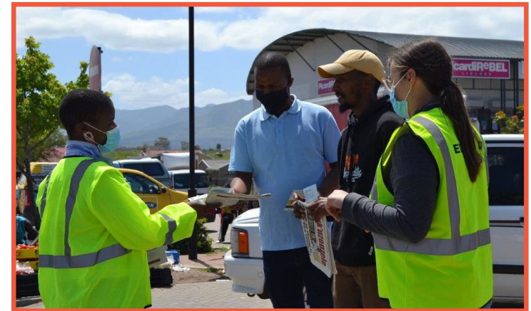
Garden Route District health practitioners distributing information material to the public.

The Government Communication and Information System (GCIS) collaborated with the Garden Route District Municipal Health Practitioners on 30 October 2020 to host a COVID-19 awareness activation at Thembaletu Taxi Rank. The event formed part of a targeted communications strategy to heighten awareness around COVID-19 Level 1 protocols. The communications campaign was grounded in the need to effect behavioural change around good hygiene, cloth-mask wearing, social distancing, and what to do when you are sick within areas where there has been a substantial increase in community transmission over the past few weeks.