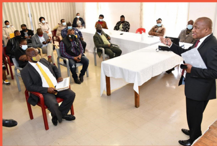
Minister Jackson Mthembu addressing stakeholders at the Revlei Hospital.