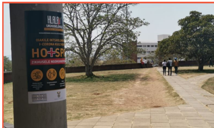
COVID-19 awareness poster mounted inside the Nelson Mandela Drive Campus.

Students were advised to download the COVID Alert App, which alert users when they are in close contact with any other user who has tested positive for COVID-19 in the past 14 days. The App is zero-rated and does not attract any data costs.