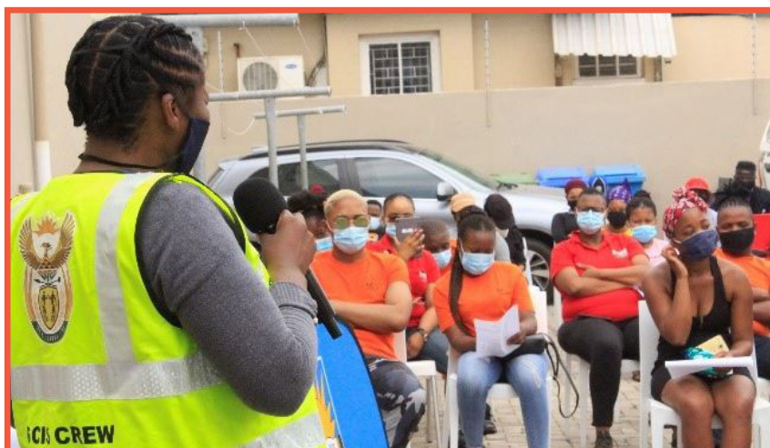
A government official engaging with the University of Fort Hare students on COVID-19.