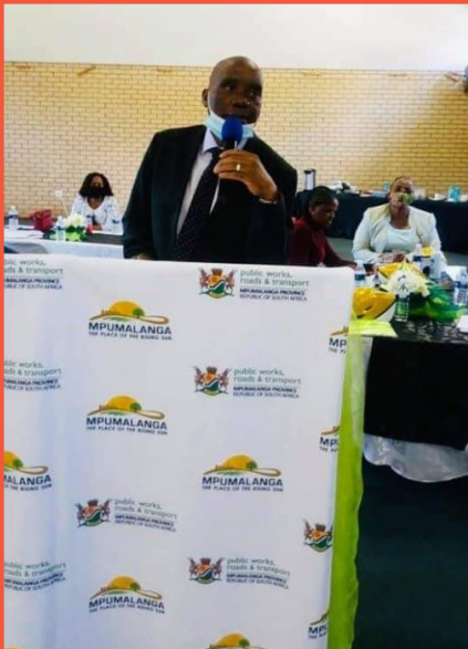
MEC Gillion Mashego addressing learners and stakeholders.