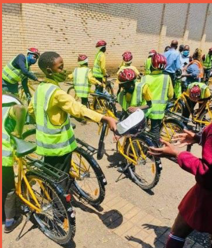
Learners receiving their bicycles.