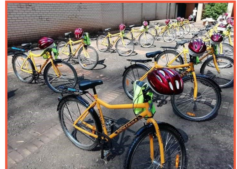
Bicycles handed over to learners with helmets for protection.

Mpumalanga MEC for Public Works, Roads and Transport Gillion Mashego together with the Executive Mayor of Thaba Chweu Local Municipality, Councillor Friddah Nkadimeng handed over bicycles to learners from various schools in Thaba Chweu, Bushbuckridge and Nkomazi local municipalities on 16 October 2020.