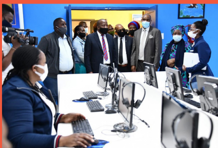
Minister Jackson Mthembu and Minister Nkosazana Dlamini Zuma visiting a media centre.