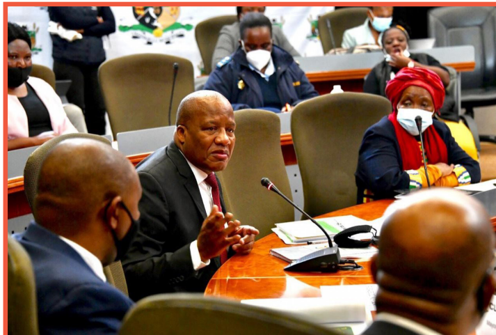
Minister Jackson Mthembu and Minister Nkosazana Dlamini Zuma during the Umzimkhulu stakeholder engagement session.