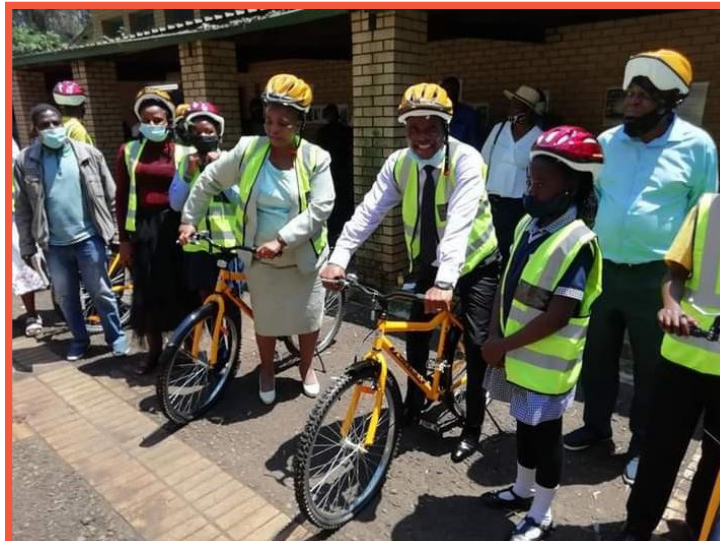
Government leaders handing over bicycles to school learners.