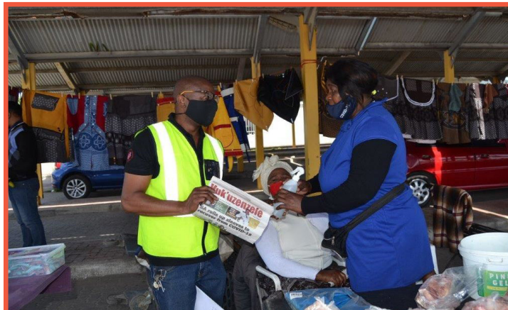
A government official handing over sanitiser and information material to a vendor.

"We are very grateful for the 500ml bottled hand sanitisers and information products. We keep on reminding our customers to wash their hands regularly, but without access to running water around here it is impossible. This will really help us to always keep safe."