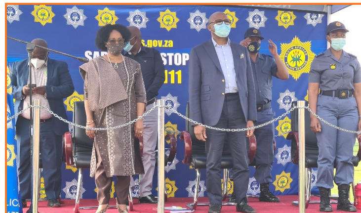
MEC Bloem and Deputy Minister Cassel Mathale with SAPS members during the Imbizo in Upington.

Deputy Minister Mathale commended the police stations in the area, for their victim friendly rooms, which adequately cater for victims.