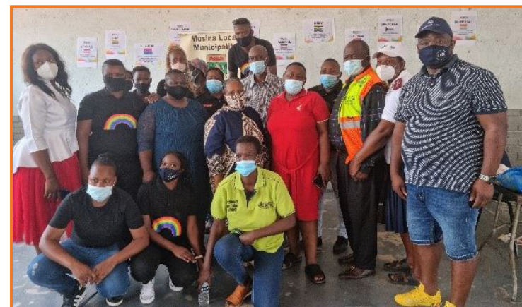
Some of the participants at the event.