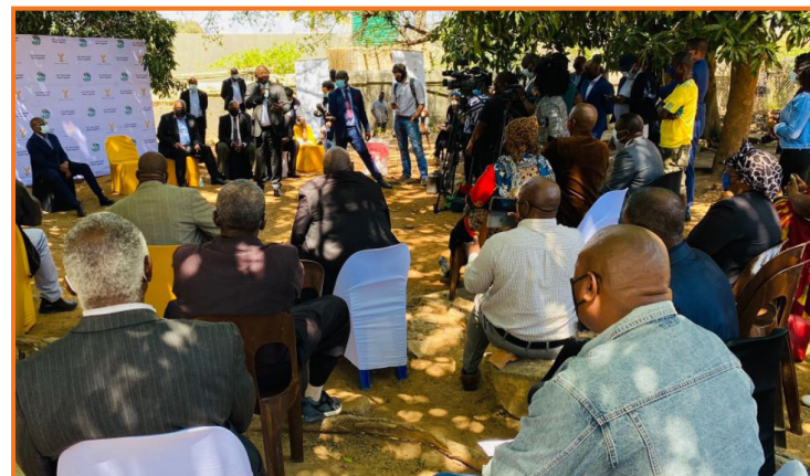
Deputy President David Mabuza having engaging with Matsamo Tribal Authority.

"I am happy today. I took the Johnson & Johnson vaccine and I am feeling very well. I am also encouraging those who have not vaccinated to vaccinate so we can save lives."