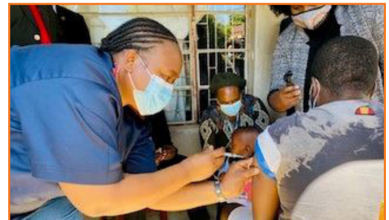
Vaccination of community members in Nkomazi.