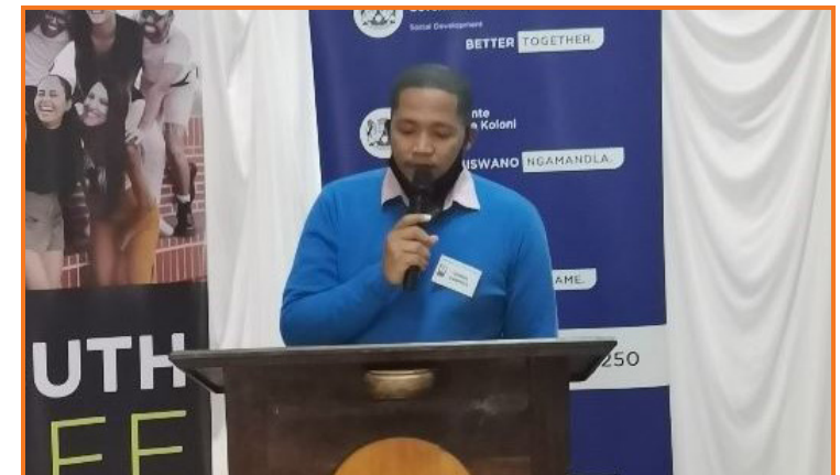
An official from the Southern Youth Film Festival Academy speaking at the event.