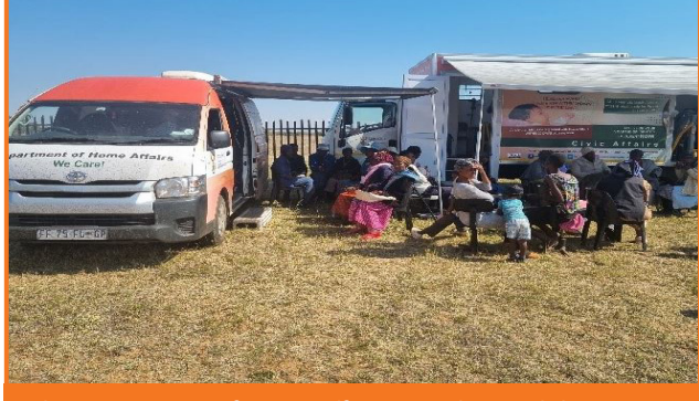
The Department of Home Affairs providing mobile services to the community.