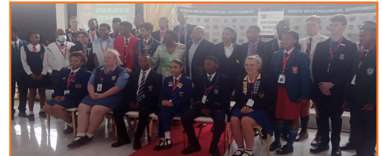
The 2022 North West top achievers.