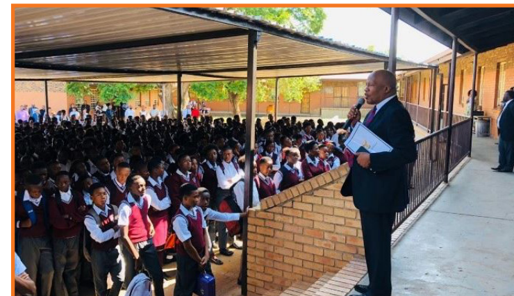
Minister Mthembu during a visit to his former school, Elukhanyisweni Secondary in Emalaheni, Mpumalanga.

These activities include the pre-2020 State of the Nation Address (SoNA), Mitchells Plain community outreach programmes, the 2020 Back-to-School