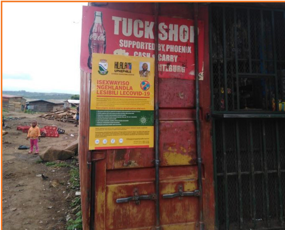
COVID-19 posters mounted at a local tuck shop.

By Mlungisi Dlamini: GCIS, KwaZulu-Natal