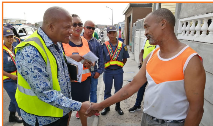
Minister Mthembu engaging with Mitchells Plain community members during the pre-2020 SoNA community activation.