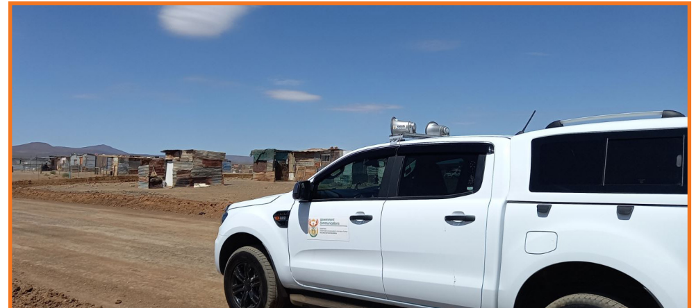
Loud hailing done in the community to remind people to follow COVID-19 regulations.

On 21 January 2021, the Government Communication and Information System (GCIS) embarked on COVID-19 safety precautions information-sharing sessions using loud hailing in Calvinia, Northern Cape.