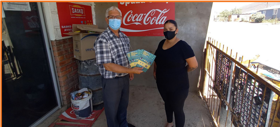
Flyers were distributed in Calvinia.