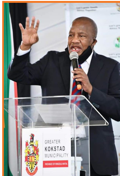
Minister Mthembu during the inauguration of the DDM in Harry Gwala District Municipality.