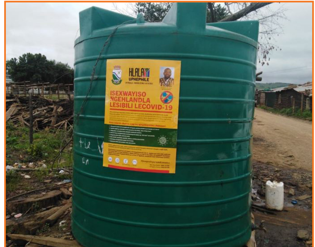
Jojo tanks were also used to display messages about Covid-19.

The uMgungundlovu District Municipality Disaster Management, the Impendle Local Municipality and other stakeholders held a loud hailing and motorcade outreach on 22 January 2021. The outreach was aimed at educating the community of Mahlutshini about dangers associated with the COVID-19 pandemic and how they can protect themselves and eliminate infections. COVID-19 awareness posters were mounted in strategic points to educate the public about the virus.