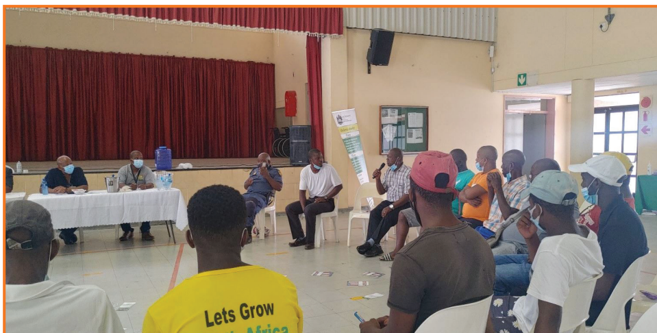
Men participating in the discussions facilitated by the KwaZulu-Natal Department of Health.

Various units from the Provincial Department of Health were on site to render services such as sugar, blood pressure testing, HIV counseling and testing, and providing advice and information.