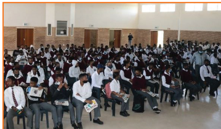
Learners who attended the dialogue at EE Monese High School.

She informed the learners about the psychological support that the social workers provide to schools.