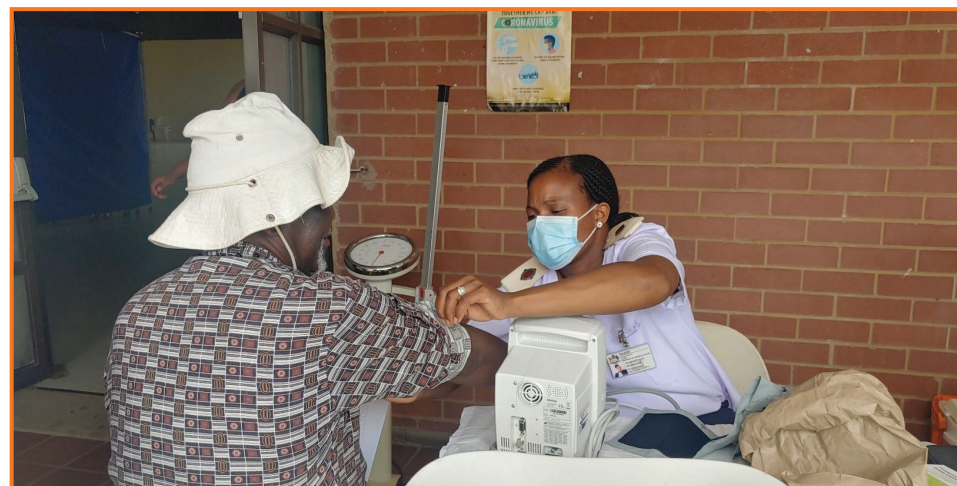
An official from the KwaZulu-Natal Department of Health serving a community member.