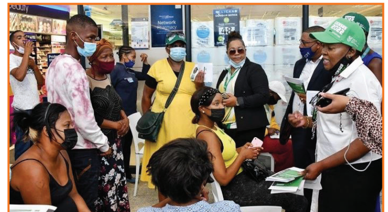
Deputy Minister Pinky Kekana urging community members to participate in Census 2022.