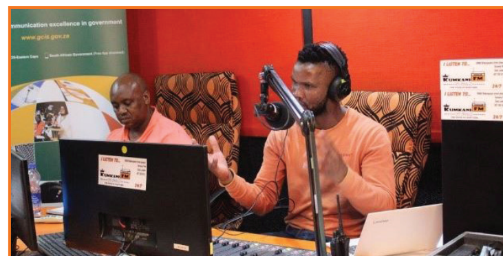
Panelists reflecting on the State of the Nation Address at Kumkani FM.