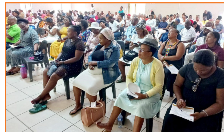
Ugu community members who attended the public consultation at Gamalakhe Community Hall.