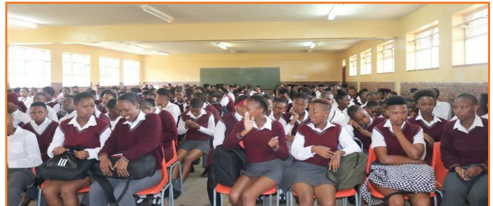
The Grade 12 learners of Ithabiseng Intermediate School who were in attendance.