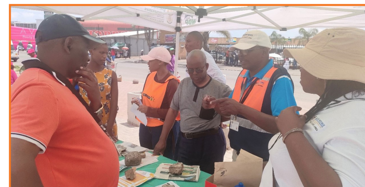
Stakeholders engaging with members of the community.