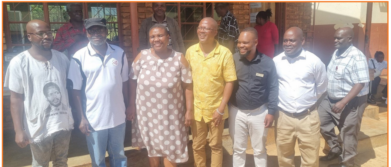
Members of Mushaathoni Student Support Programme.

“We are ready to provide necessary needs as required,” he said.