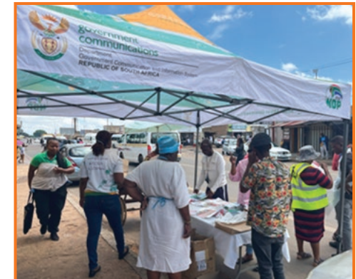
SoNA activation at Kwaggafontein in the Thembisile Hani Local Municipality.