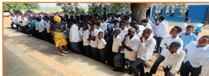
Makobo High School learners listening to tips and advice from government officials.