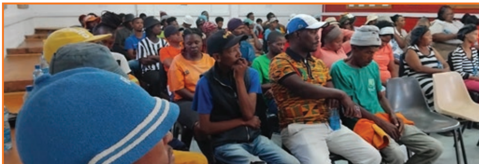
Residents from Richmond participated in the event.

Various stakeholders participated in the event, including the departments of Social Development (DSD), Justice and Constitutional Development, Correctional Services (DCS), South African Police Service (SAPS), National Prosecuting Authority (NPA) and several non-governmental organisations working in the GBVF sector. The DCS led the presentation on restorative justice and offender rehabilitation, highlighting its partnership with the DSD to address the harm caused by crime through victim, offender and community involvement. SAPS and the NPA also shared updates on GBVF case statistics and the status of cases within the district.