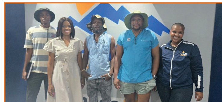
Photos taken after the public education radio slot at Ekhephini Community Radio studios.