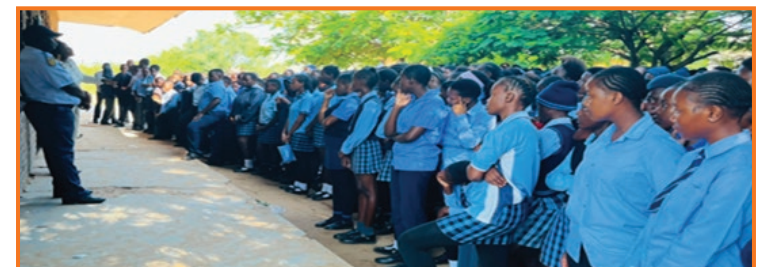
Learners at Khesethwane High School received information on bullying.