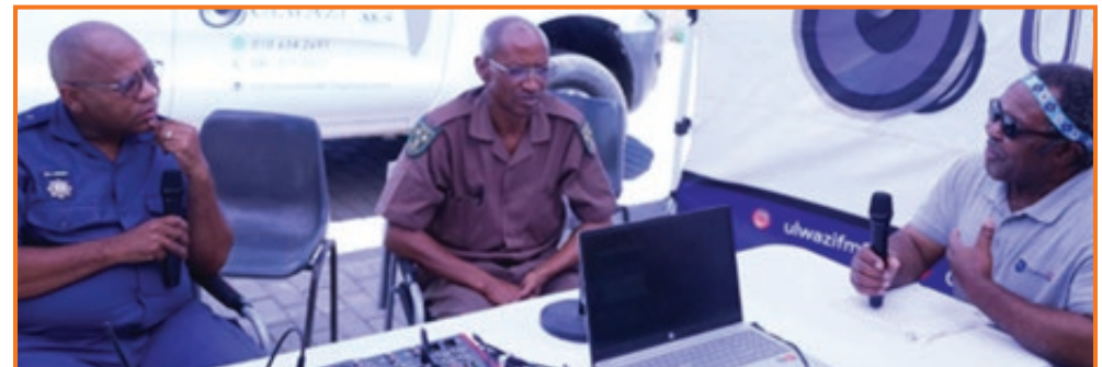
Officials from the DCS and SAPS during a live radio interview on Ulwazi FM with the GCIS presenter.