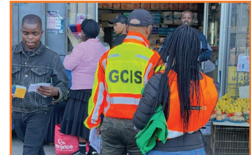
GCIS officials share information and conduct education activities at Machibisa Shopping Mall.