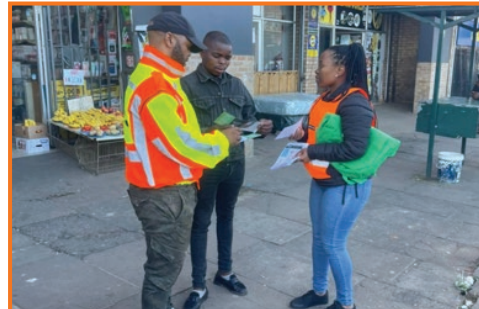
GCIS officials and ward committee members creating awareness to citizens about Child Protection Month.

GCIS continues to call on parents, caregivers, teachers, community leaders and all citizens to work together to create safe environments where every child is protected, valued and supported.