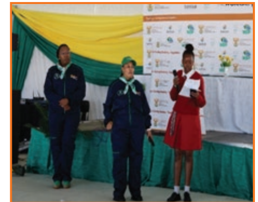
Students participating at the event to mark the end of CPM.