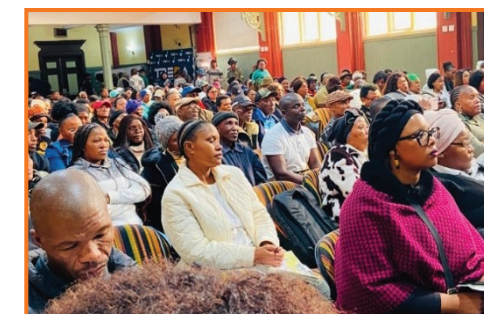
Executive Mayor Faku and Minister Ndabeni addressed entrepreneurs and members of the media during the Small Business Clinic.