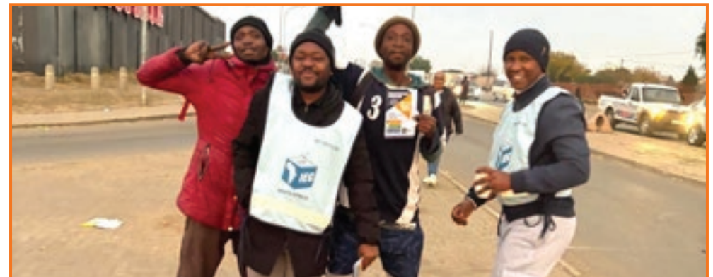
IEC officials at the street activation in Galeshewe.