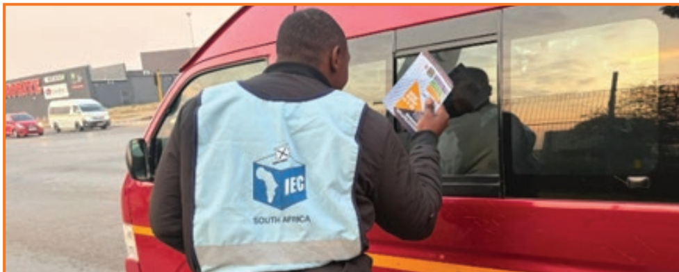
IEC and GCIS officials distribute voter registration pamphlets to members of the public.

The activation created an important platform to promote active citizen participation and reinforce the message that voter registration was essential to strengthen South Africa's democracy.