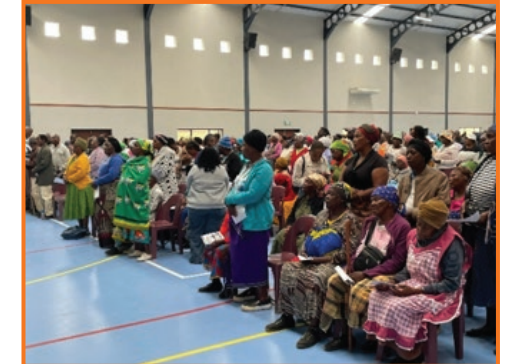
Residents from Mgobodzi and surrounding villages attended the imbizo in large numbers and accessed services offered by participating government departments and partners present there.