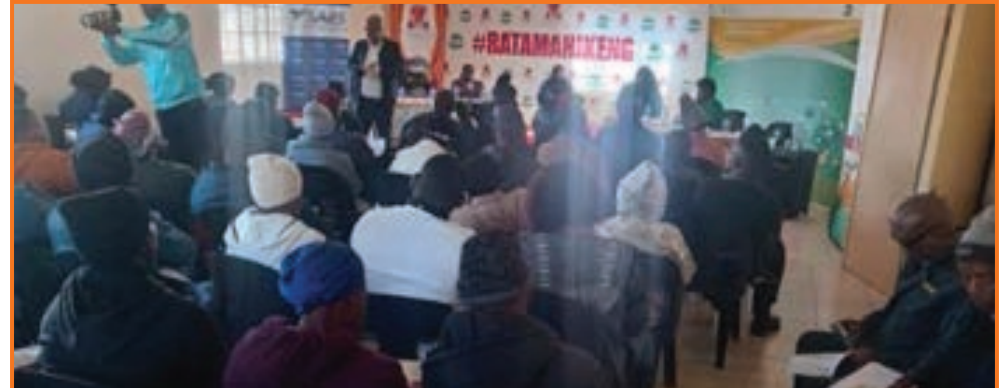
Community members and youth from Gelukspan attended the seminar in large numbers.