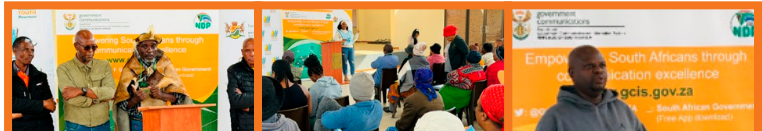
Inkosi Mahlangu reflected on 30 years of the Constitution and encouraged young people to vote for credible leaders.

As South Africa celebrates 30 Years of the Constitution, such initiatives play an important role in ensuring that citizens remain active participants in shaping their future and contributing to national development.