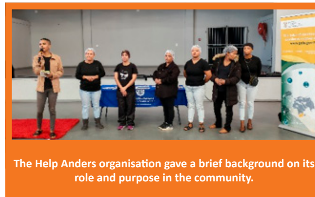
The Help Anders organisation gave a brief background on its role and purpose in the community.