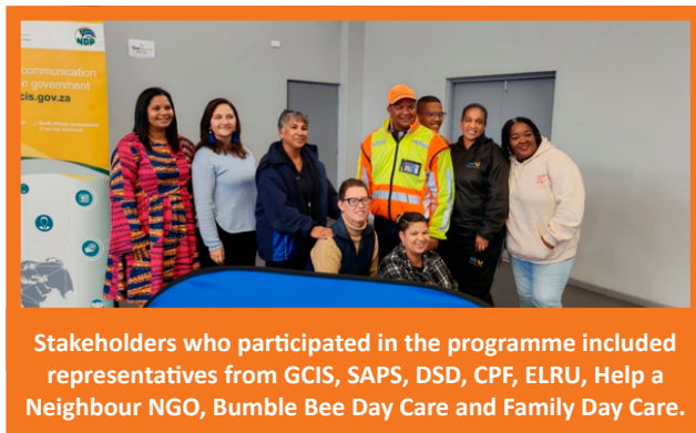
Stakeholders who participated in the programme included representatives from GCIS, SAPS, DSD, CPF, ELRU, Help a Neighbour NGO, Bumble Bee Day Care and Family Day Care.

Government remained committed to working with communities and stakeholders to promote child safety, social cohesion and awareness of services available to the public.