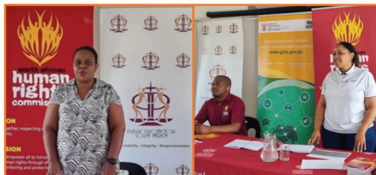
Officials from the SAHRC, PPSA and the CGE engaging the community.

The session concluded with a proposal for a subsequent engagement with the Chapter 9 institutions' Legal units. Complaint forms were distributed to individuals who wished to register their dissatisfaction.