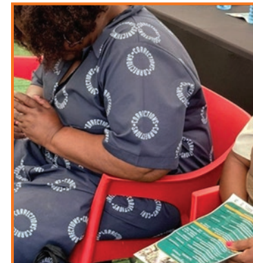
An ex-offender who shared her experience of being convicted of fraud and corruption.