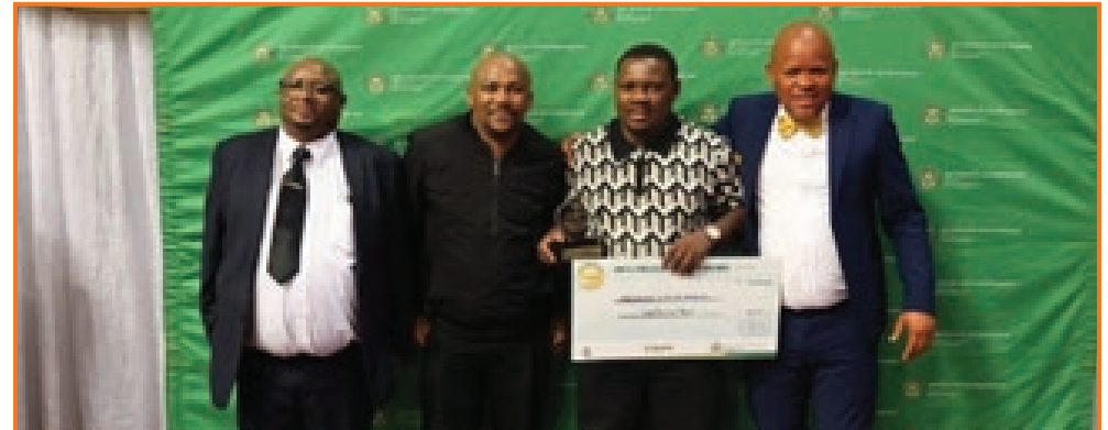
The Molo brothers posing with departmental officials during the Agricultural Awards hosted by MEC Rockman.