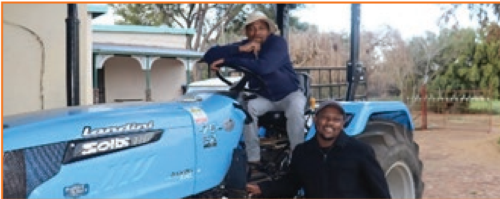
The brand new Landini tractor donated by the department.