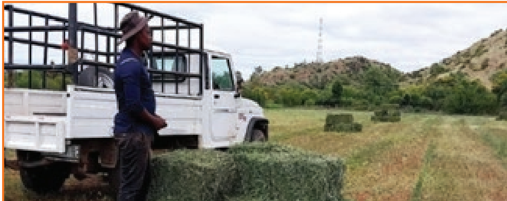
Lucerne harvested at the farm.