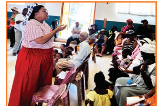
Mayor Cloete addressing the community.