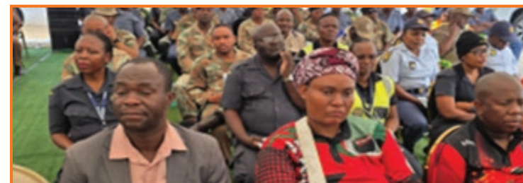
Participants during the Musina Beitbridge Anti-Corruption Awareness Campaign.