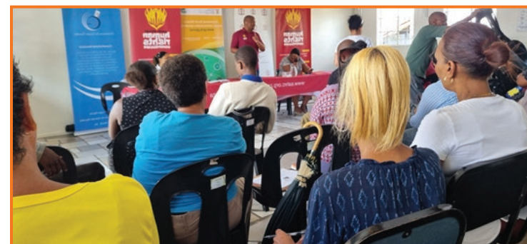
Community members attended the programme in numbers and asked questions.