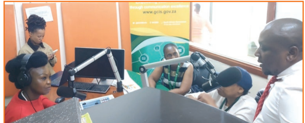
Colleagues from the NPA and KOSH Crisis Centre engaging with the interviewer during the Public Education Programme.