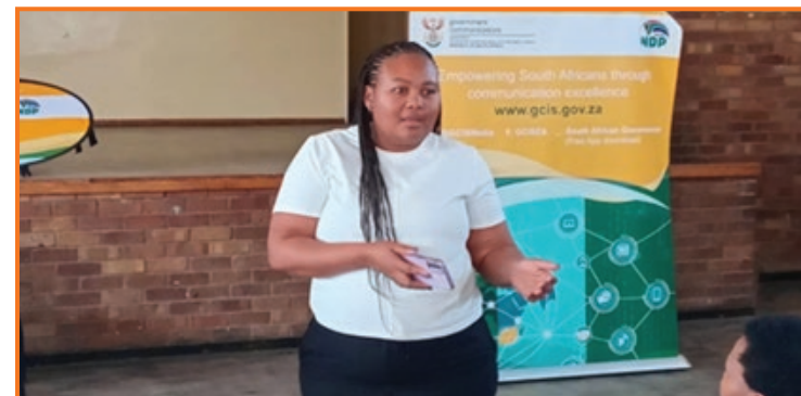
Ms Pikelela from SEDFA sharing information with attendees.