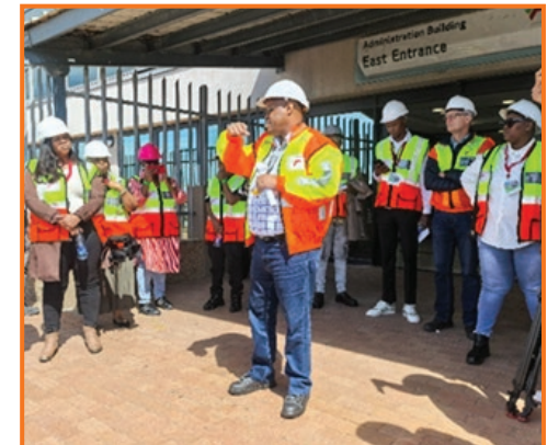
GCIS and Transnet Port Terminals EC G20 Roundtable in pictures.