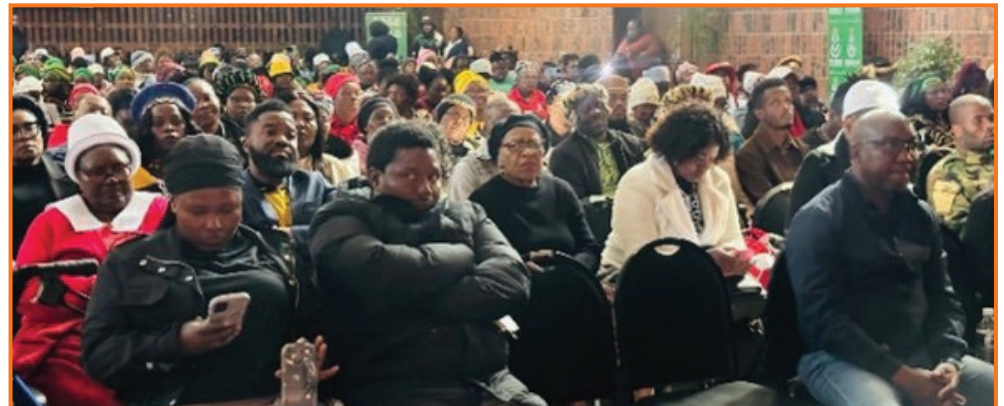
Some of the participants attending the prayer session.