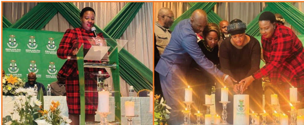
Deputy Minister Ntshalitshali, delivering her key message and facilitating the candlelight session.

This Women's Month Prayer Day not only highlighted the challenges facing Emalahleni, but also reaffirmed the role of faith, leadership and community solidarity in overcoming adversity and building a safer, more compassionate society.