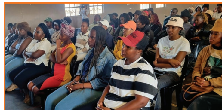
Community members listening to presentations by stakeholders.