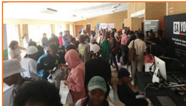
Students visiting various exhibition stalls.