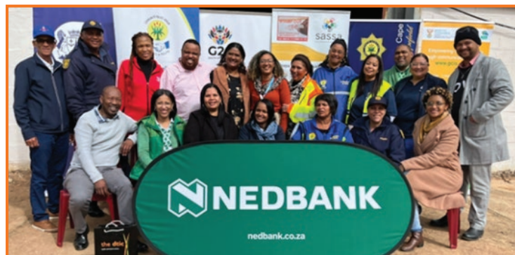
All the local stakeholders who supported the day.