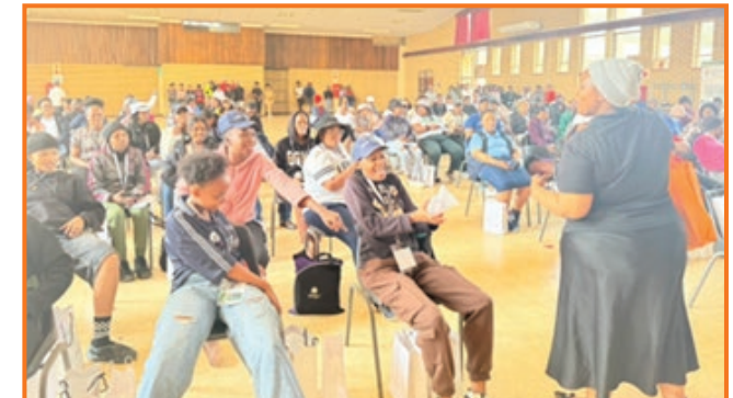
Students answering questions on the G20 during an interactive session.