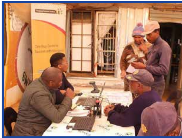
SASSA and SAPO officials assisting community members to apply for the new grant cards.