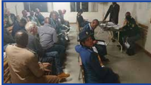
Stakeholder making presentations on issues of crime.

In the recent weeks, Klerksdorp has seen a high number of incidents of crime and lawlessness. There have been daring and fatal armed bank robberies in the city centre, protests and looting of stores and tuckshops in the nearby township of Jouberton, violent and aggressive house and business robberies, and theft of motor vehicles, among other incidents. On 24 May 2018, the Klerksdorp Community Policing Forum in partnership with the South African Police Service (SAPS), Neighbourhood Watch, the Government Communication and Information System (GCIS), and other stakeholders, conducted a community dialogue to fight crime in the community.