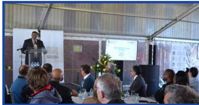
Minister Gugile Nkwinti addressing the audience.

On 5 June 2018, Nestlé South Africa launched its R88-million zero-water dairy manufacturing facility at the Nestlé Plant in Mossel Bay, Western Cape. The facility will allow Nestlé to reduce the factory's water consumption by more than 50% during the first year of implementation by reusing the water recovered from the milk evaporation process, saving 168-million litres of water a day. The facility will eventually further reduce its municipal water consumption to zero.