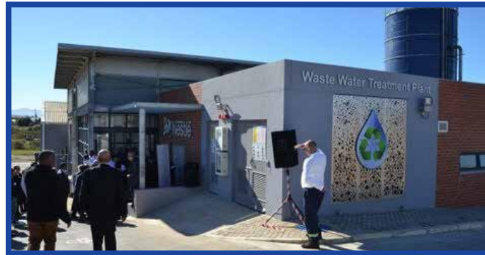
The zero-water plant building.