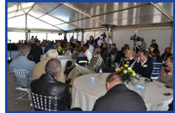
Some of the people who were in attendance.

Water and Sanitation Minister Gugile Nkwinti, meanwhile, stated that the plant was in line with the Department of Water and Sanitation’s National Water and Sanitation Master Plan, which encouraged the development of alternative water sources for water security, including recycling, reuse, desalination and groundwater optimisation. “This plant will lead to a reduction in water demand, thereby contributing to an increased life span of water and sanitation infrastructure,” said the Minister.