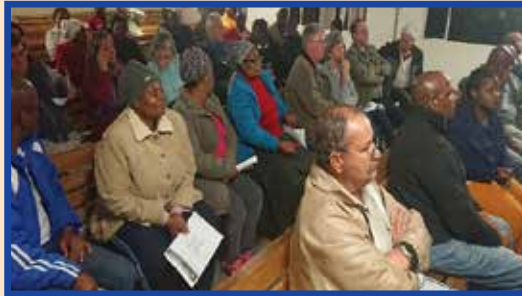
Community members who attended the dialogue.