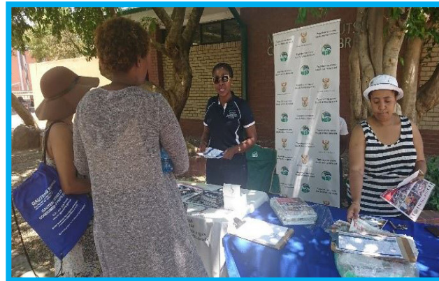
Government officials distributing information materials to the public.