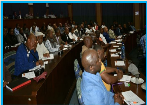
Delegates attending the Men's Parliament.