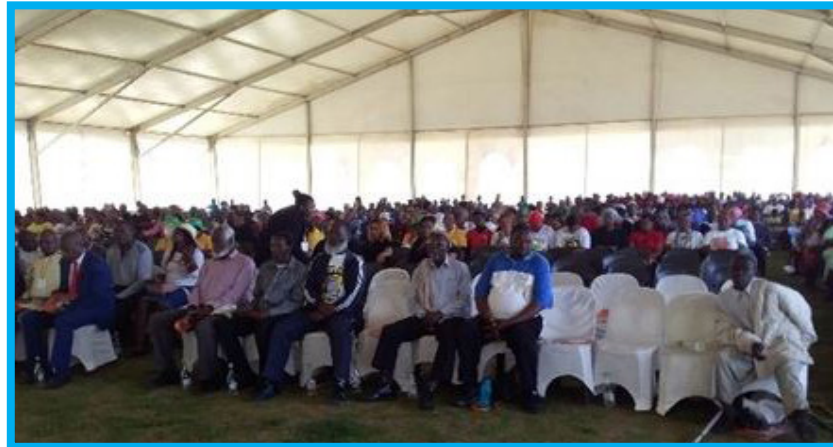
Community members attending the launch.