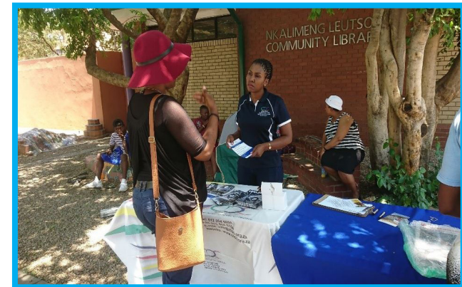
An official from the Council of Debt Collectors sharing information about fair debt collection.

As part of the Sedibeng District Communication Forum pop up activation, various government departments visited Sharpeville to provide the community with government information that will help them improve their standard of living. The event took place on 26 October 2018.