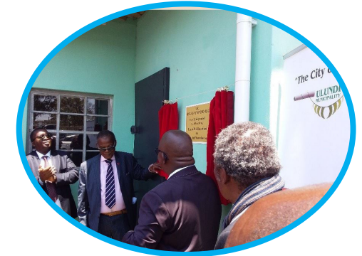
Officials unveiling the plaque at Mashona Sports Field.

"As the municipality, we expect this project to bring about much-needed employment opportunities for our local young people and also reduce criminal activities in the area of Mahlabathini," said Mayor Ntshangase.