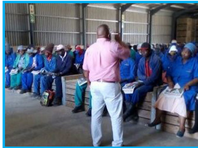
A South African Human Rights Commission official addressing the workers.