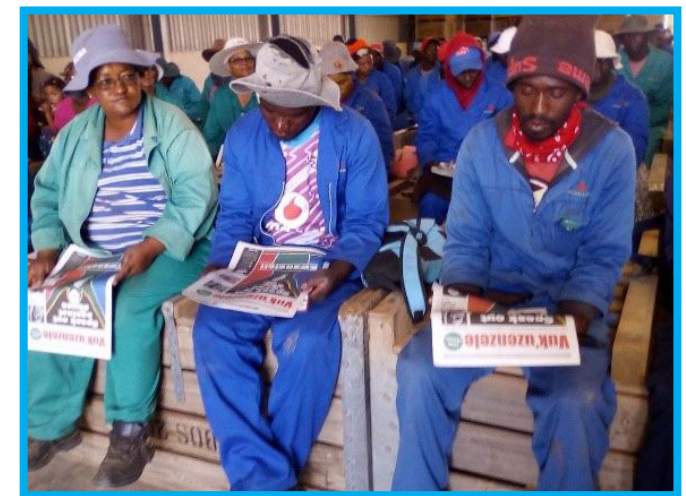
Farm workers with some of the information materials they received

On 15 November 2018, workers from Soetmelkvlei farm in Riviersonderend received government information at their doorstep. The Government Communication and Information System, the South African Human Rights Commission and community development workers in the area partnered to ensure that information is brought closer to the community members working on the farm.