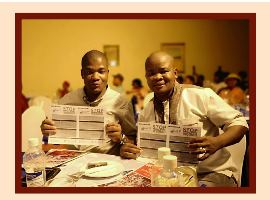
Two of the attendees of the Local Communicators' Forum said:

"We are totally against any form of violence and abuse. We plead with the community to join the fight against violence."