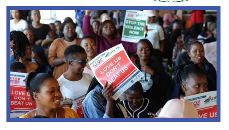
Female students displaying the placards against violence.

Exhibition, engagement and dissemination of information at TUT was conducted by the Government Communication and Information System; GRIP; Department of Community Safety, Security and Liaison; South African Police Service; National Prosecuting Authority and the Hawks. The success was that five cases were reported on site and dockets opened while some would be referred to the nearest police stations such as the Kanyamazane Police Station.