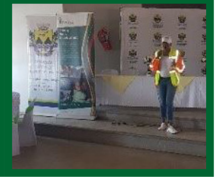
An official from the Department of Transport presenting to the youth.