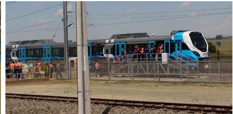
Dignitaries taking a train ride on Gibela-Prasa Train testing track.

Executive Mayor Masina said, “The presence of the advanced manufacturing plant, stimulates the city’s manufacturing capability, ensures revenue collection through rates and taxes, and improves socio-economic development of communities within the City of Ekurhuleni.”