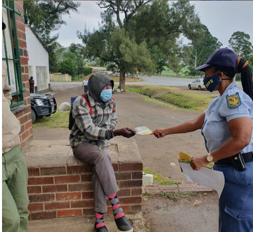
Law-enforcement officials educating Harry Gwala residents of COVID-19 regulations and handing over some key pamphlets.

The Harry Gwala District and civil society embarked on a COVID-19 and vaccination awareness programme on 23 February 2021. This was a response to the outbreak of the COVID-19 second wave and to create awareness about government’s vaccination roll-out.