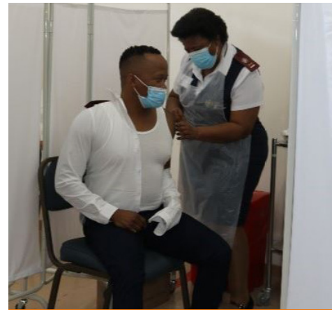
A healthcare worker being vaccinated.