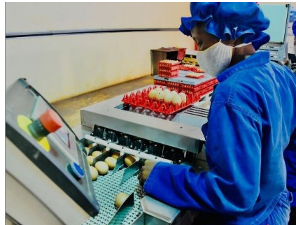
Grading and sorting of eggs at Bela Bela CPA.