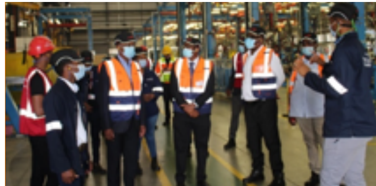
Government leaders and stakeholders during the tour of Gibela-Prasa Train Manufacturing Plant.

Gauteng Premier David Makhura together with Transport Deputy Minister Dikeledi Magadzi, Trade and Industry Deputy Minister Fikile Majola, Gauteng Economic Development MEC Parks Tau, and City of Ekurhuleni Executive Mayor Mzwandile Masina visited Gibela-Prasa train manufacturing factory in Dunnottar, Nigel on 3 March 2021.