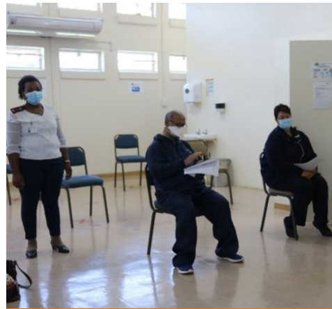
Healthcare workers waiting to be vaccinated at Bongani Hospital.