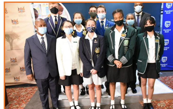
Top-10 matric 2020 learners in Northern Cape.

The Northern Cape Provincial Government celebrated its top achievers in style, during the Matric 2020 Awards ceremony that was held at the Protea Hotel in Kimberley, on 23 February 2021.