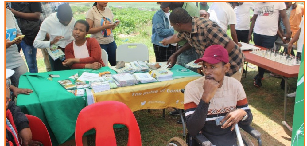
Community members accessing government material at the event.