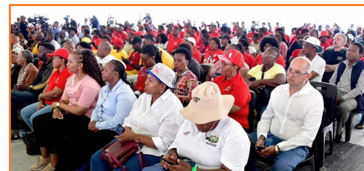
Community members who attended the event in Bloemfontein.