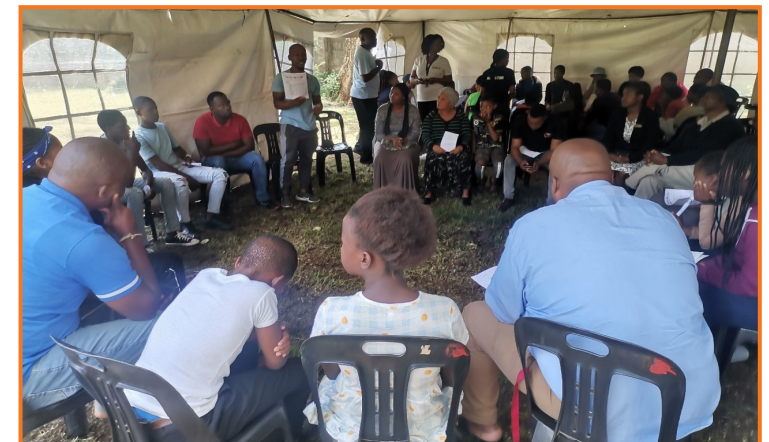
Different stakeholders participating on the discussion during a community dialogue in Edendale.