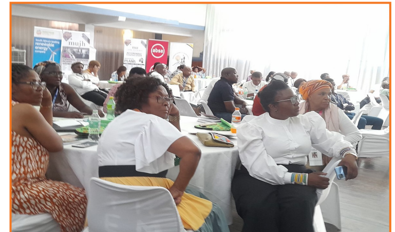
SMMEs members who attended the summit.