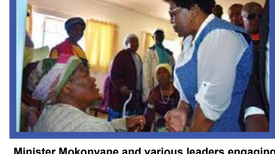
Minister Mokonyane and various leaders engaging with patients receiving healthcare services at the Cofimvaba Hospital.