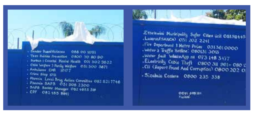
A wall with numbers for assistance regarding crime and servicedelivery issues.