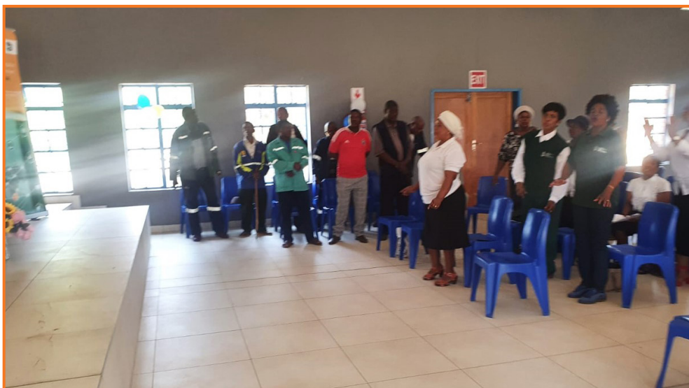
Community members of Mokgalwana who were in attendance.

Other stakeholders such as AURUM, community health workers, the Department of Cooperative Governance and Traditional Affairs, traditional leaders and religious bodies in the district, provided information on various illnesses and the programme they have to address those health issues.