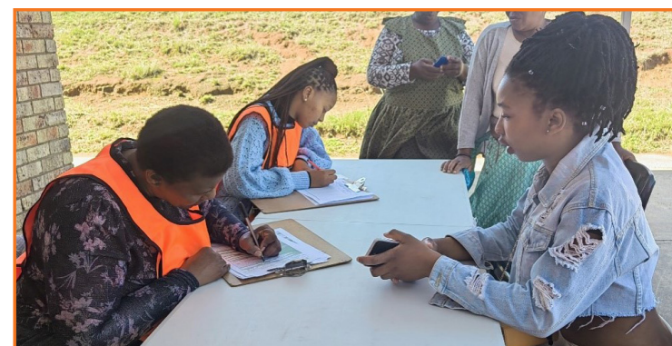
Officials from the Department of Employment and Labour registering community members on their database for employment opportunities.

The Government Communication and Information System hosted the Thusong Service Centre programme services on wheels outreach at Qunu Thusong Service Centre, in Qunu near Mthatha, on 22 September 2022.