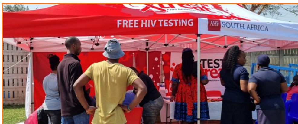
Qadi community members receiving healthcare services from the Department of Health.