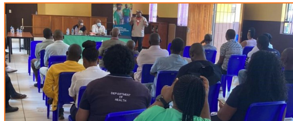
Various stakeholders engaging with the Qadi community.