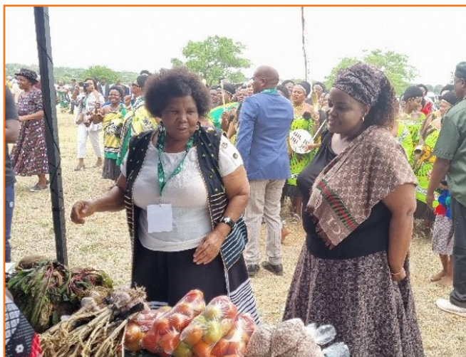
Deputy Minister Nokuzola Capa with the entourage during a walkabout at the exhibition stalls where women displayed and sold their vegetables.