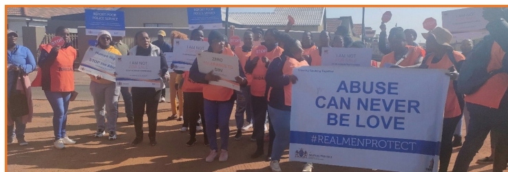
Women marching to Mohlakeng Police Station to hand over a memorandum of complaints.