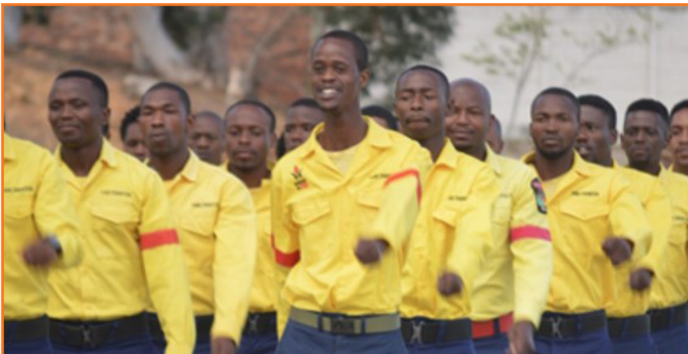
Firefighters doing a march and drill session prior to the launch of the fire awareness campaign.

He further called on all role players and stakeholders, to join our efforts to reduce disaster risk. This multi-stakeholder launch will be followed by a series of fire awareness education drives for communities in fire-prone areas in the province particularly in the Overberg Region, as it has been identified as an area of concern.