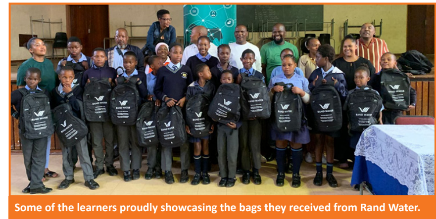
Some of the learners proudly showcasing the bags they received from Rand Water.