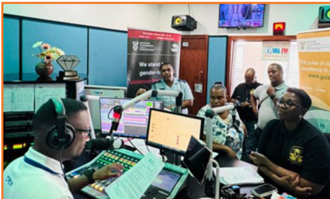
The panel discussion on Revival FM focused on GBVF.

Civil society expressed their gratitude to government and the private sector, for always empowering them on how to deal with GBVF cases.