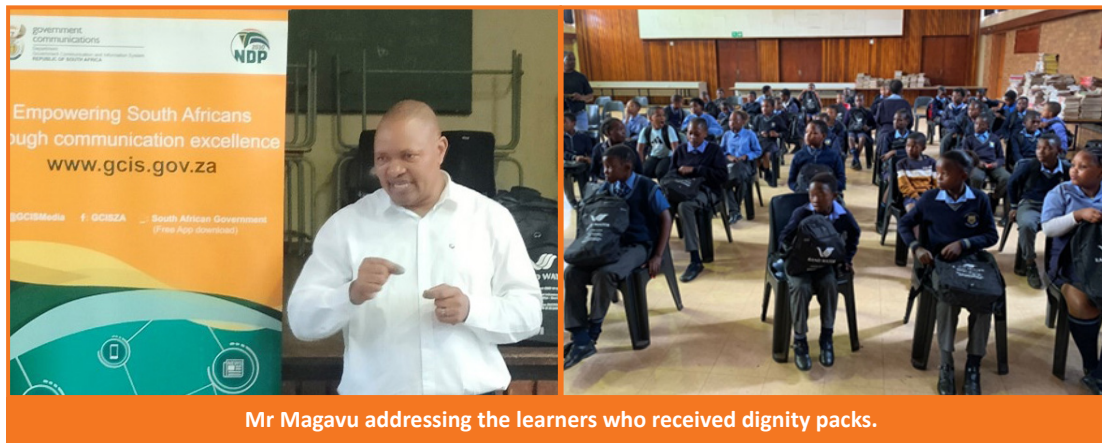
Mr Magavu addressing the learners who received dignity packs.

The Chairperson of the School Governing Body (SGB) and members of the Zuurbekom Ward Committee also supported the programme.