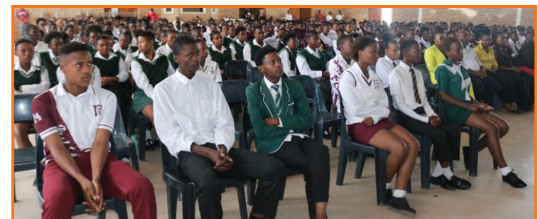
Learners from various schools in Matwabeng in attendance at the Back-to-School campaign programme.