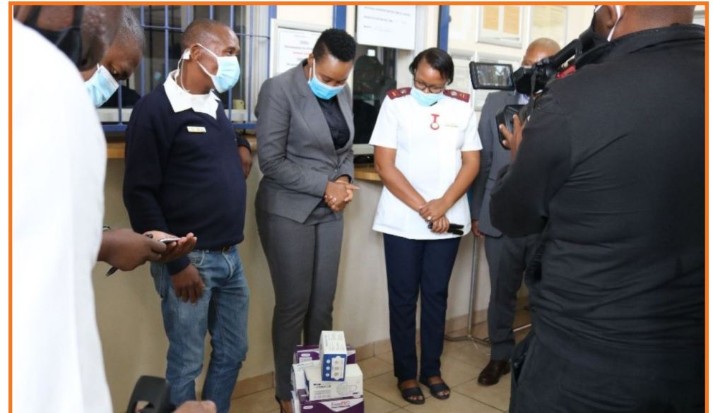
Minister Stella Ndabeni-Abrahams handing over personal protective equipment to the Marantha Clinic.

The Minister of Communications and Digital Technologies, Stella Ndabeni-Abrahams, visited the community of Majwemasweu in Brandfort together with the Free State Education MEC Tate Makgoe on 2 February 2021 for an oversight of government programmes. Minister Ndabeni-Abrahams monitored the implementation process of the broadcasting digital migration project, as there were a number of inefficiencies that were identified in the area, such as slow pace of installation, lack of after care and faulty devices.