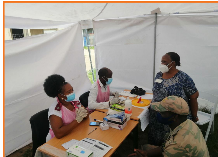
Department of Health officials screening and testing patients at Mbazwana.