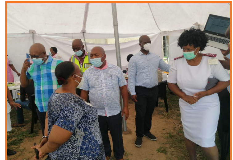
Department of Health COVID-19 team briefing District Director on processes undertaken from testing until results are received by the patient.

As the country continues to tackle the COVID-19 pandemic, healthcare workers had to come up with innovative ways to ensure that people who have tested for COVID-19 receive their results timeously. For this reason, the KwaZulu-Natal Department of Health launched a rapid COVID-19 screening, testing and results programme on 27 January 2021 at Mbazwana Clinic in Umhlabuyalingana Local Municipality.