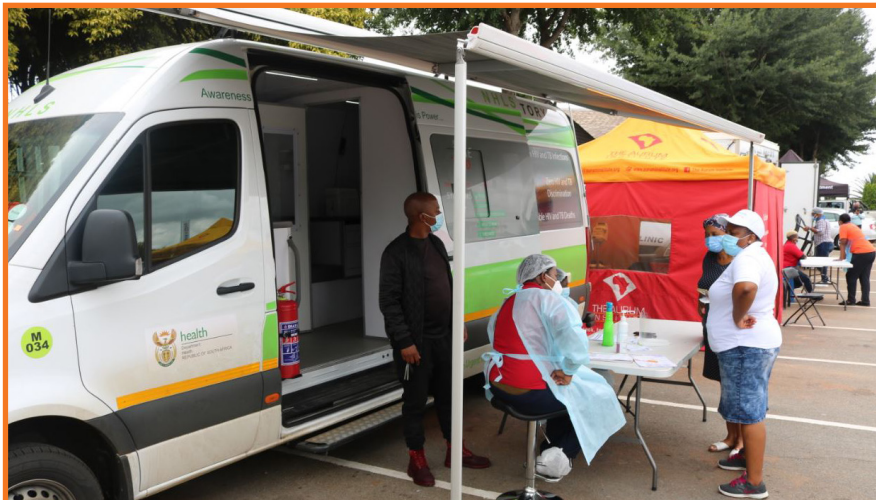
Community members visiting different exhibitions to get health information and services.