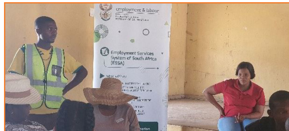
Eskom and the Department of Labour rendering services to community members.