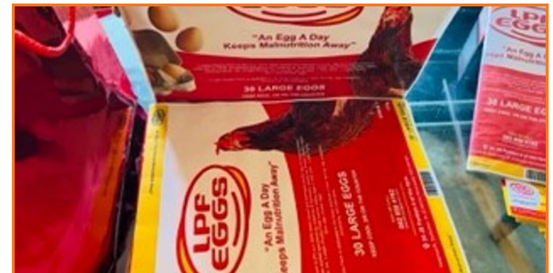
Lungile Poultry Farm eggs production and the marketing tools.