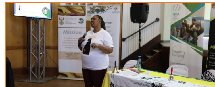
Deputy Minister Hendrietta Bogopane-Zulu addressing the attendees.