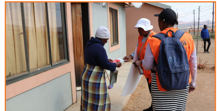
Stakeholders visiting homes in Rantanda to engage with community members.