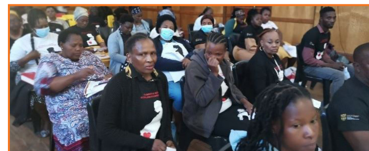
Women engaging on issues of alcohol affecting their community.

The ninth day of the ninth month is observed as Foetal Alcohol Syndrome Day and it aims to create awareness about the dangers of alcohol to unborn children. The number "nine" signifies the full term of pregnancy during which mothers should avoid alcohol consumption.