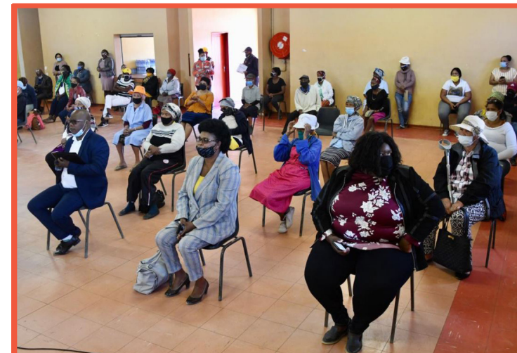
Some of the community members of Augrabies who attended the event.