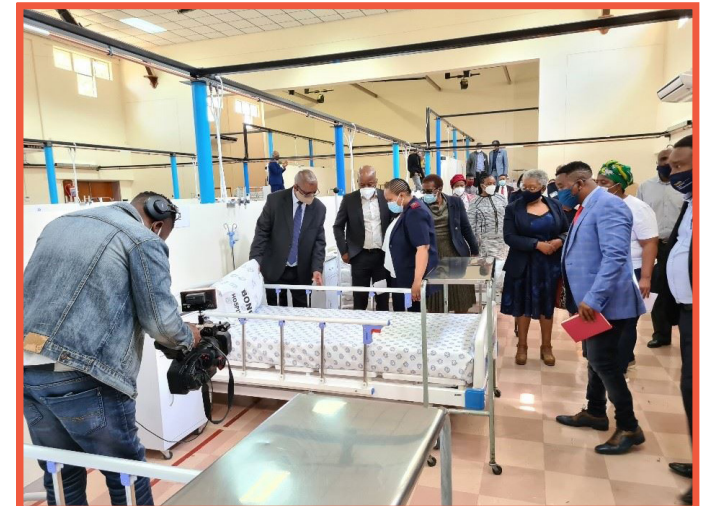
Lejweleputswa Municipality leaders and Free State Department of Health officials assessing the surge ward.

A large number of cases of COVID-19 infections around Matjhabeng Municipality makes it a hotspot area. Bongani Regional Hospital, therefore built a ward to accommodate COVID-19 patients only. The facility, which used to be home for nurses, was officially opened on 15 September 2020 in Thabong.