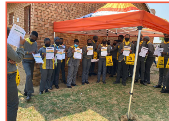
Some of the Grade 12 learners at Sifunile Secondary School with information products they received.

The Government Communication and Information System (GCIS) in collaboration with Emakhazeni Education Circuit, University of Mpumalanga, and the Department of Home Affairs conducted a school activation on 18 September 2020, as part of celebrating Public Service Month and Annual Thusong Service Centre Week by bringing services closer to the people.