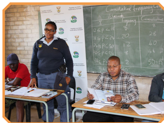
A police officer presenting on the SAPS's role in cases of crime and abuse.