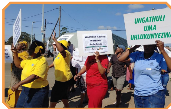
The women of Ndwedwe marching against gender-based violence.