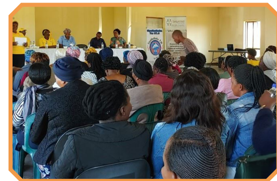
Community members who attended the session.

The Department of Social Development (DSD) in partnership with Lethokuhle Women's Organisation, FAMSA, Legal Aid South Africa, KwaZulu-Natal Department of Economic Development, Ndwedwe Local Municipality hosted an information-sharing session on 21 August 2019 on domestic violence and other issues affecting women.