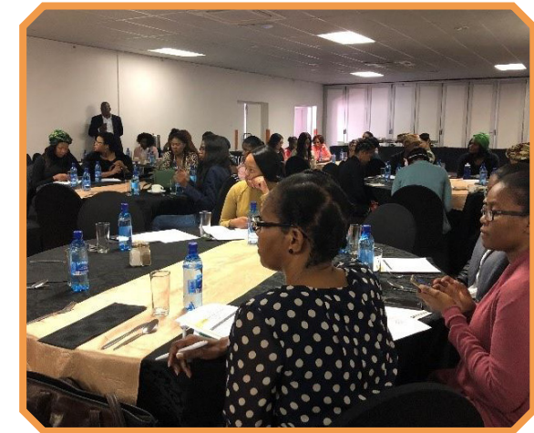
Stakeholders and beneficiaries who were in attendance.

The National Youth Development Agency (NYDA) in the Northern Cape hosted a networking breakfast session for female beneficiaries of its programmes in Kimberley on 23 August 2019, with the aim of affording them the opportunity to network and engage concerning the status of their businesses.