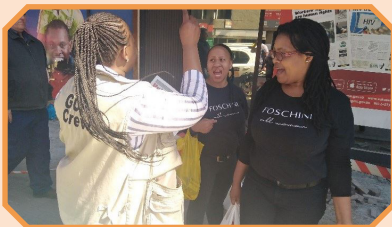
A government official engaging with women on gender-based violence.