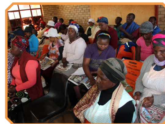
Community members who were in attendance.

The Government Communication and Information System (GCIS) organised an information-sharing session on gender-based violence in Mayflower Gate, Mpumalanga on 20 August 2019. A GCIS official led and directed the programme in which various stakeholders such as the Department of Labour, South African Police Service (SAPS), Department of Social Development and Pastors' Forum made empowering and informative presentations on GBV.