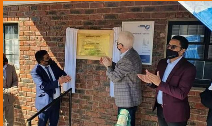
Western Cape Premier Alan Winde led the unveiling of the plaque.