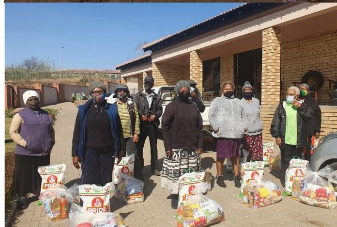
Some of the old age and disability centres that benefited from the Emalahleni COVID-19 food relief programme.

The Emalahleni Local Municipality is the epicentre of COVID-19 cases in Mpumalanga and this has led to a high number of people being retrenched due to the pandemic. The municipality, in partnership with local businesses and mines, created a food zone storeroom where food parcels were donated.