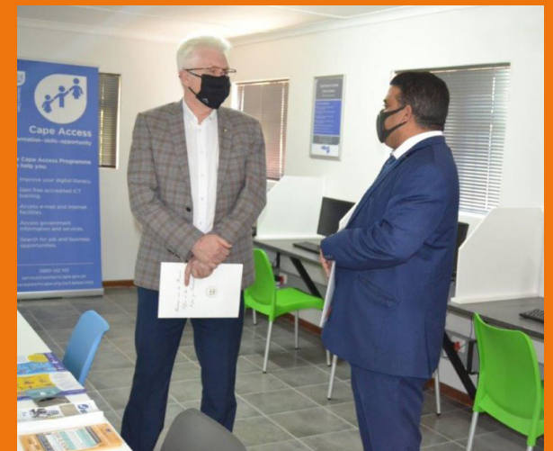
Western Cape government leaders inside the recently opened Melkhoutfontein e-Centre.

Western Cape Premier Alan Winde and Human Settlements MEC Tertius Simmers, accompanied by Hessequa Municipal Mayor Grant Riddles and Garden Route District Mayor Memory Booysen, officially opened the Melkhoutfontein e-Centre on 10 August 2020 in Hessequa Municipality.