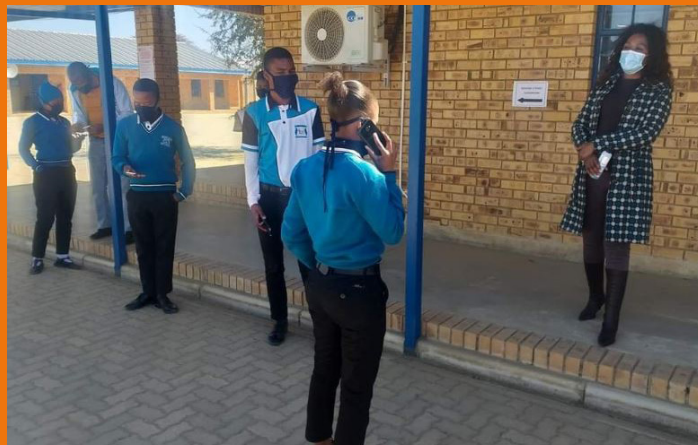
Onkabetse-Thuto Secondary School learner dialling a tutor during the launch.

In its efforts of bring the classroom closer to learners launched the “Dial-a-Tutor” programme at Onkabetse-Thuto Secondary School in Ratlou Local Municipality on 5 August 2020. The long school break necessitated the department to initiate a programme that aims to provide learners with an individual attention from subject specialists without disturbance from other learners.