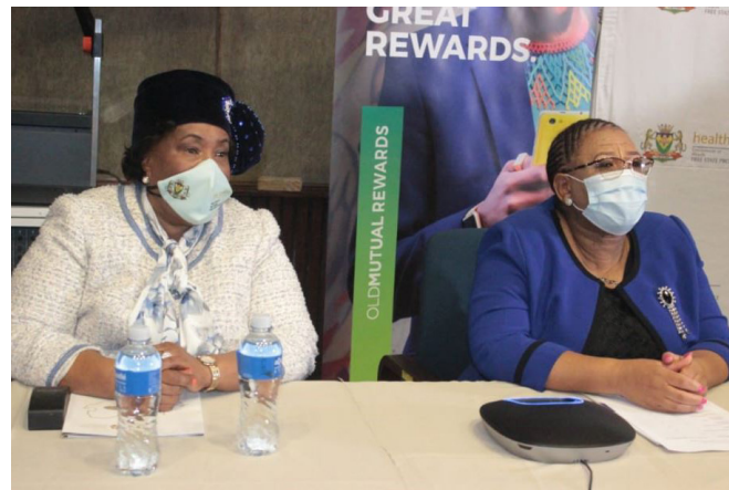
Free State Premier Sefora Ntombela and MEC Montseng Tsiu during the opening of the high-care unit.