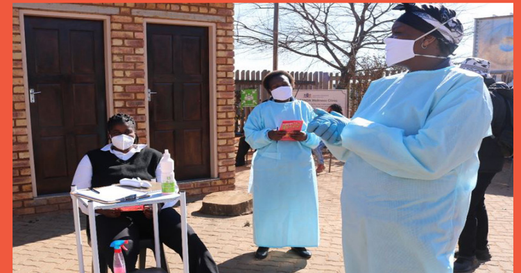
Health officials educating community members about COVID-19.

As part of the COVID-19 awareness campaign, the Government Communication and Information System in support of the Department of Health hosted an awareness activation in Ratanda on 7 July 2020. The purpose of the activation was to share information on precautions to follow towards prevention of the spread of the virus, symptoms and how to get treatment if one is infected.