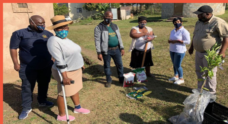
A sample of the agricultural starter packs handed to beneficiaries.