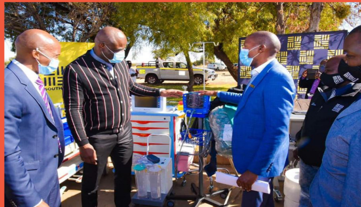
Personal protective equipment and testing equipment donated to the Northern Cape Health Department.