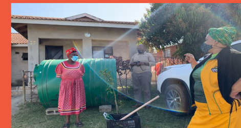
A beneficiary receiving implements, seed packs, fruit tree and JoJo water tank.

Building on the launch of the One Home, One Food-Garden and One Fruit Tree Programme in KwaDukuza Local Municipality, Enterprise iLembe rolled out the programme in Mandeni on 31 July 2020. The One Home, One Food-Garden is a poverty alleviation programme targeted at people who have been left without an income due to COVID-19. This initiative has benefitted 10 families and 58 individuals, identified by the Department of Agriculture and Rural Development in the townships of Mathonsi, iSithebe and Sundimbili in Mandeni.