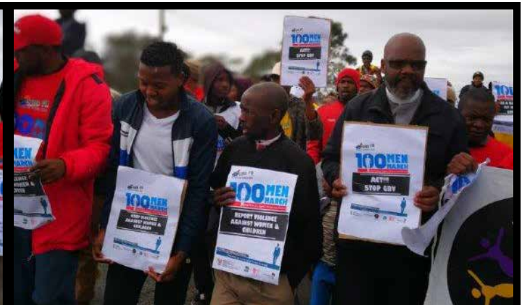
The community of Scenery Park at the 100 Men March.

Community members including the youth of Scenary Park and surrounding areas gathered for the march against women and children abuse on 13 July 2018. Government Communication and Information System in the Buffalo City Metro in partnership with the South African Police Service and civil society organisations joined hands to tackle abuse against women and children.