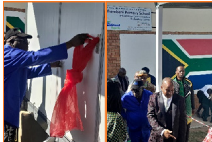
Deputy Minister Mahlalela handing over a newly built kitchen to Ethembeni Primary School in partnership with TiKA.

The Deputy Minister also addressed parents, educators, members of the school governing body and learners, urging them to keep the structure clean, well maintained, and guard against criminals and vandalism. The educators and learners were delighted to receive such an important facility for their school.