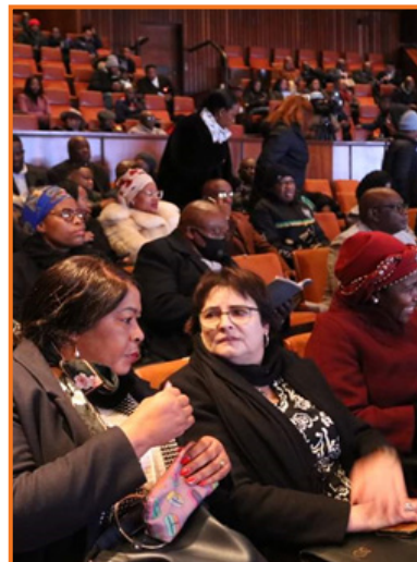
Attendees at the event.