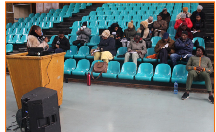
Various stakeholders at the session.