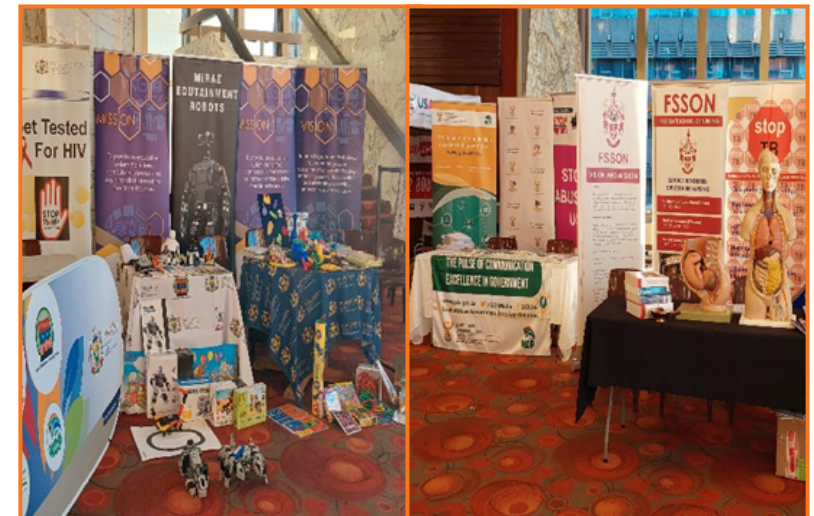
Exhibition stalls at the Imbizo.