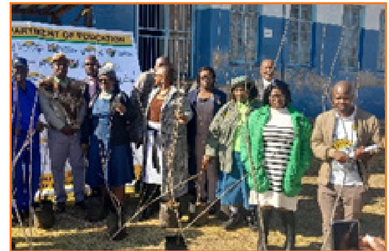
Deputy Minister Mahlalela handing over and planting trees at Simtfolile High School and Ethembeni Primary School respectively.